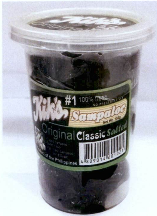
Figure 4. Unregistered KIK'S Sampaloc Original Classic Salted Flavor