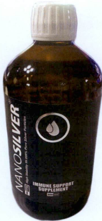
Figure 2. Unregistered NANO Silver Immune Support Food Supplement