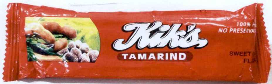
Figure 3. Unregistered KIK'S Tamarind Sweet Chili Flavor