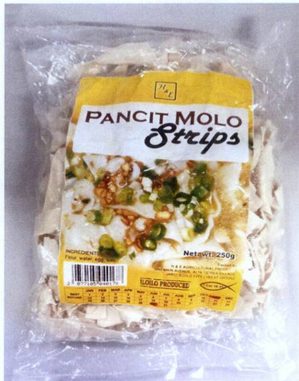
Figure 5. Unregistered H&E Pancit Molo Strips