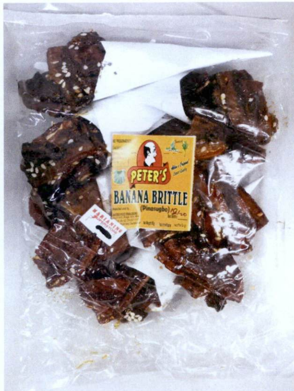
Figure 4. Unregistered PETER'S Banana Brittle (Pinasugbo)