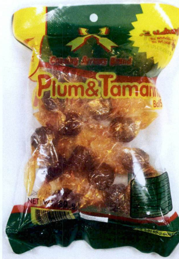
Figure 2. Unregistered COSSING ARROWS BRAND Plum & Tamarind Balls