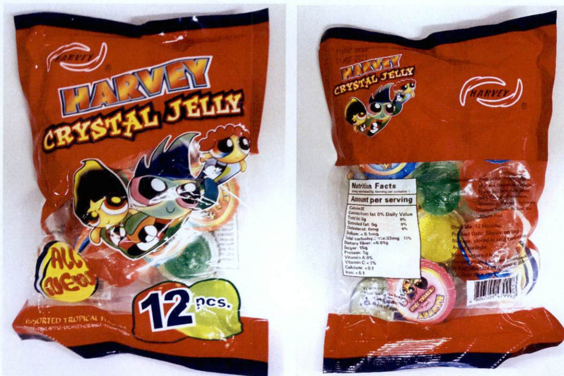
Figure 3. Unregistered HARVEY Crystal Jelly Assorted Tropical Flavors