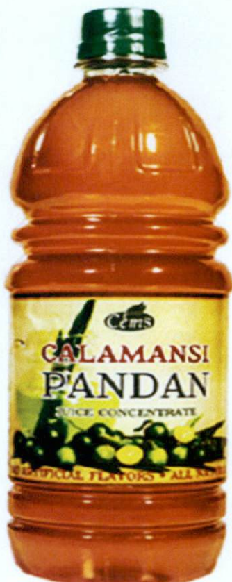
Figure 1. Unregistered CEM'S Calamansi Pandan Juice Concentrate

The Food and Drug Administration (FDA) warns all healthcare professionals and the general public NOT TO PURCHASE AND CONSUME the following unregistered food products: