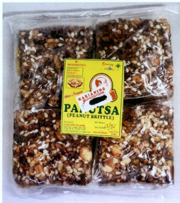
Figure 5. Unregistered PETER'S Panutsa (Peanut Brittle)