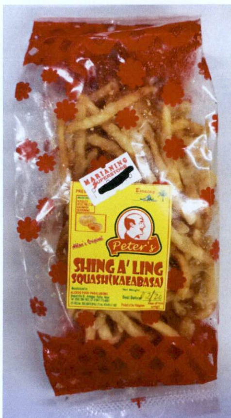
Figure 1. Unregistered PETER'S Shing A' Ling Squash (Kaeabasa)

The Food and Drug Administration (FDA) warns all healthcare professionals and the general public NOT TO PURCHASE AND CONSUME the following unregistered food products: