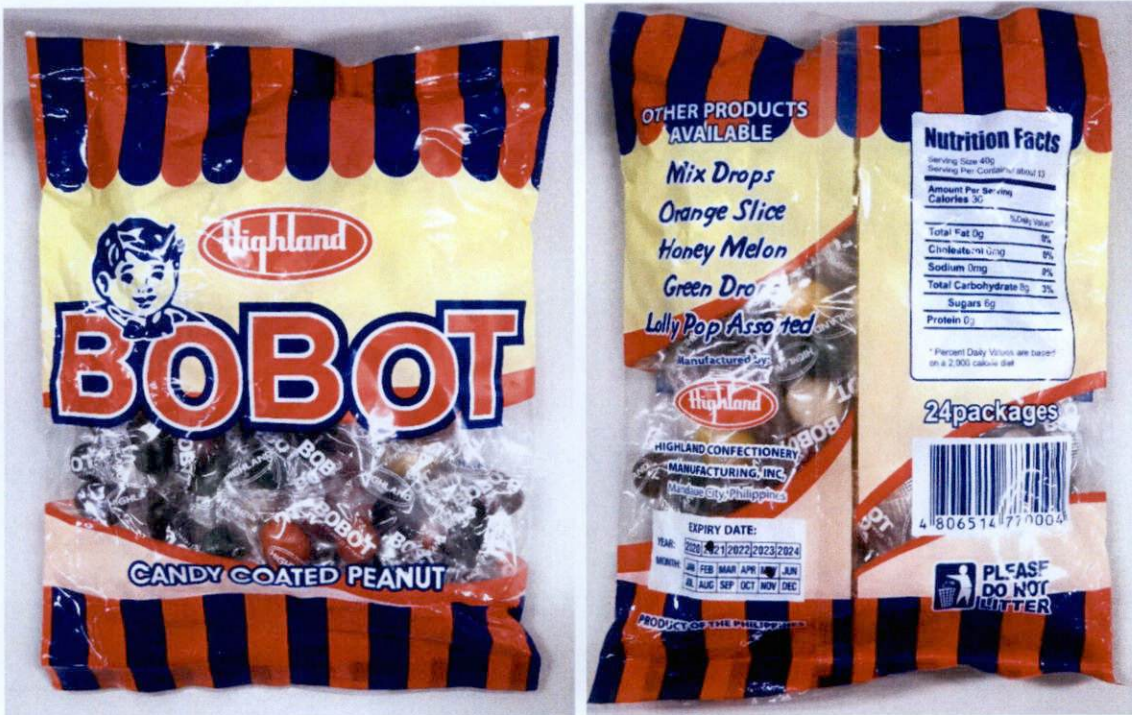
Figure 2. Unregistered HIGHLAND BOBOT Candy Coated Peanut