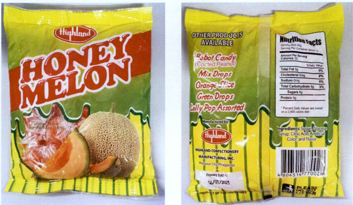
Figure 3. Unregistered HIGHLAND Honey Melon Candy