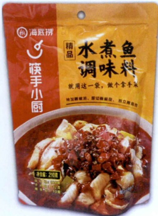
Figure 4. Unregistered Red and Orange Foil Pouch with Image of Meat and Chili Soup (In Foreign Language)