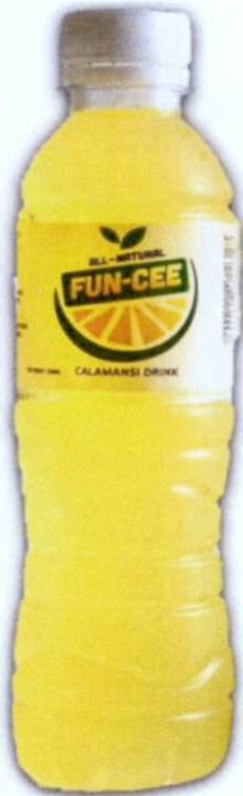
Figure 2. Unregistered FUN CEE Calamansi Juice