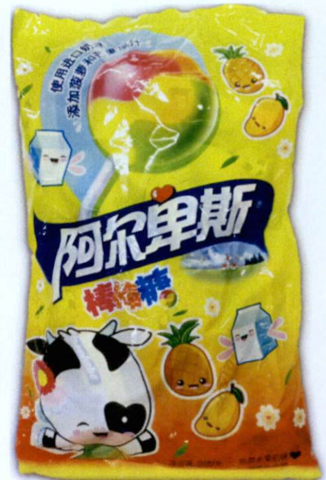
Figure 5. Unregistered Yellow and Orange Plastic Pouch Packaging with Image of Lollipop and Cow (In Foreign Language)