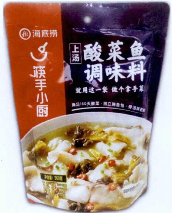
Figure 3. Unregistered Red and Violet Foil Pouch with Image of Fish Soup with Chili (In Foreign Language)