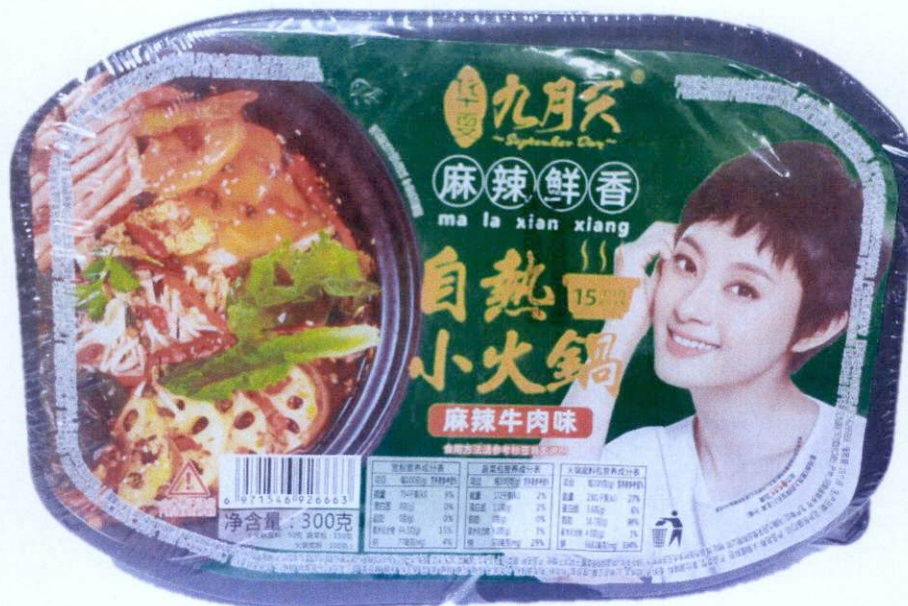
Figure 1. Unregistered MA LA XIAN XIANG with Green Label with Image of Woman (In Foreign Language)

The Food and Drug Administration (FDA) warns all healthcare professionals and the general public NOT TO PURCHASE AND CONSUME the following unregistered food products: