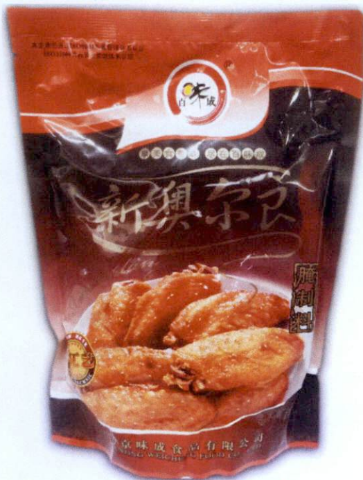
Figure 4. Unregistered Red and Maroon Foil Pouch with Image of Chicken Wings (In Foreign Language)