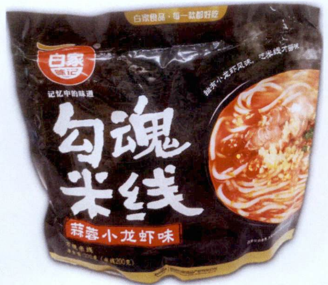
Figure 3. Unregistered Noodles in Black and Gold Foil Pouch Packaging (In Foreign Language)