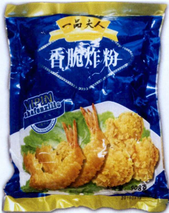
Figure 2. Unregistered YIPIN Zhafenxilie Breading Flour in Blue and Gold Packaging with Image of Fried Shrimps (In Foreign Language)