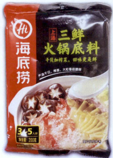
Figure 5. Unregistered HI Black and Red Foil Pouch with Image of Soup with Shrimps and Mushrooms (In Foreign Language)