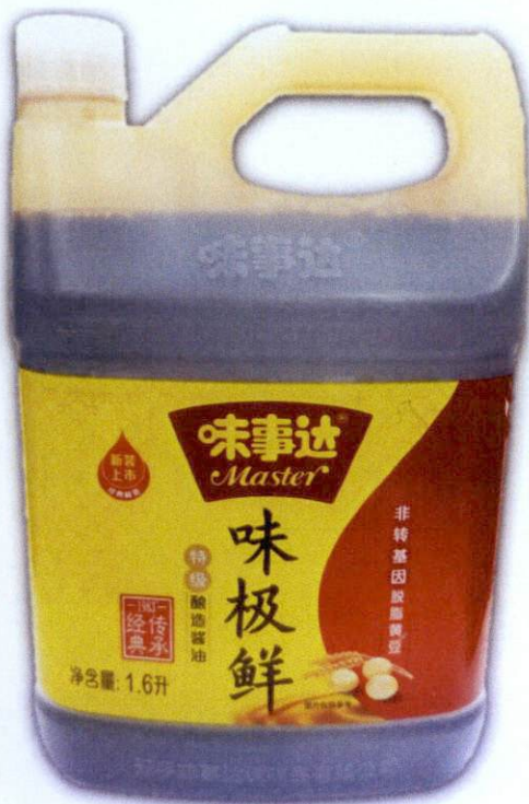
Figure 4. Unregistered MASTER Soy Sauce with Red and Yellow Label in Plastic Container (In Foreign Language)