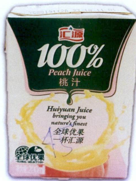
Figure 1. Unregistered GLOBAL SELECTION 100% Peach Juice Huiyuan Juice (In Foreign Language)

The Food and Drug Administration (FDA) warns all healthcare professionals and the general public NOT TO PURCHASE AND CONSUME the following unregistered food products: