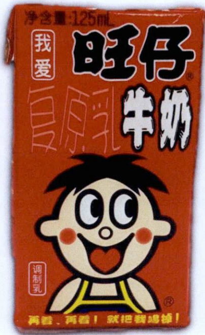
Figure 2. Unregistered Beverage in Red Carton Packaging with Image of Boy (In Foreign Language)