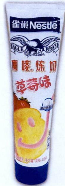
Figure 3. Unregistered NESTLE Eagle Brand Aluminum Tube with Image of Sandwich Strawberry Flavor (In Foreign Language)