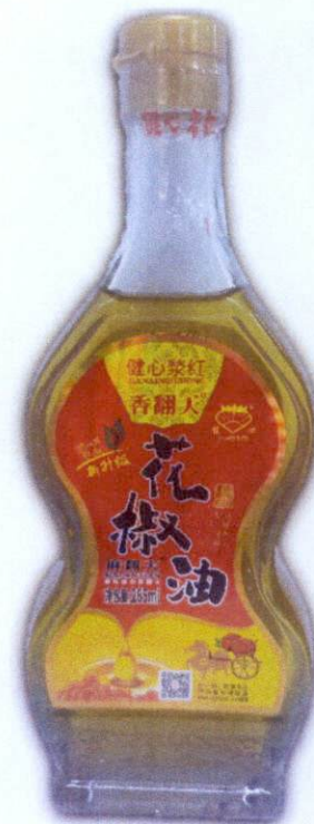
Figure 5. Unregistered JIANXINQIUHONG Mafantian in Glass Bottle with Red Label (In Foreign Language)