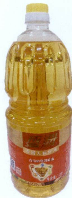
Figure 5. Unregistered Cooking Oil 1 Liter with Red Label (In Foreign Language)