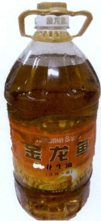
Figure 3. Unregistered ARAWANA BRAND Cooking Oil with Image of Peanuts in Orange Label (In Foreign Language)