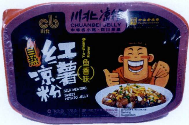
Figure 2. Unregistered CHUANBEI JELLY Self-Heating Sweet Potato Jelly Yu-Shiang Flavor (In Foreign Language)