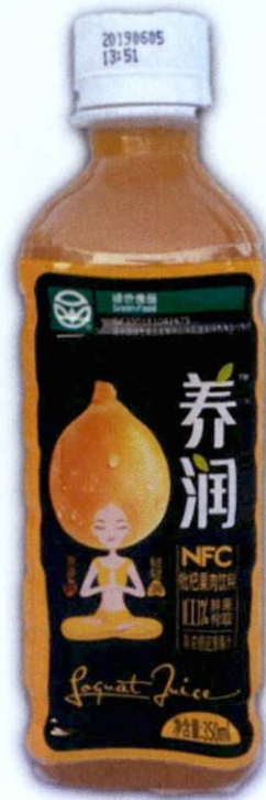
Figure 1. Unregistered Beverage in Clear Plastic Bottle with Image of Woman (In Foreign Language)

The Food and Drug Administration (FDA) warns all healthcare professionals and the general public NOT TO PURCHASE AND CONSUME the following unregistered food products: