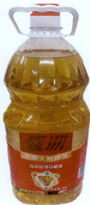
Figure 4. Unregistered Cooking Oil 1 Gallon with Red Label (In Foreign Language)