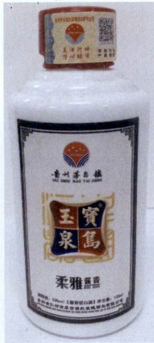
Figure 2. Unregistered GUI ZHOU MAO TAI ZHEN in White Glass Bottle (In Foreign Language)