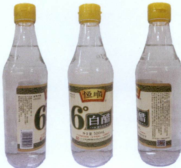
Figure 1. Unregistered JIANGSU HENGSHUN VINEGAR INDUSTRY CO., LTD 6° in Clear Glass Bottle with Green and White Label (In Foreign Language)

The Food and Drug Administration (FDA) warns all healthcare professionals and the general public NOT TO PURCHASE AND CONSUME the following unregistered food products: