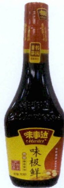
Figure 3. Unregistered MASTER with Image of Soy Bean and Wheat in Glass Bottle with Yellow Label (In Foreign Language)