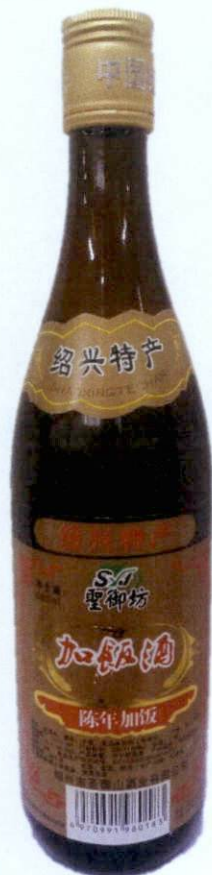
Figure 4. Unregistered SHAOXIANGTECHAN Amber Glass Bottle with Gold Label (In Foreign Language)