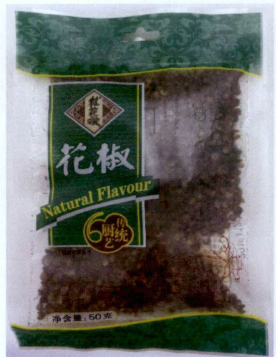
Figure 5. Unregistered NATURAL FLAVOR Semi Ground Black Pepper with Green Label in Transparent Plastic Packaging (In Foreign Language)