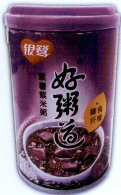
Figure 4. Unregistered Tin Can with Violet Label with Image of Porridge with Taro Cubes (In Foreign Language)