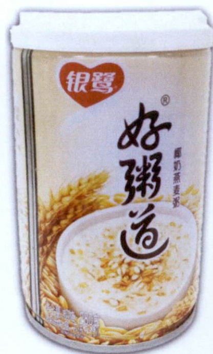
Figure 3. Unregistered Tin Can with Light Brown Label with Image of Porridge (In Foreign Language)