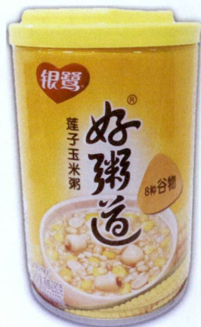
Figure 5. Unregistered Tin Can with Yellow Label with Image of Mushroom and Corn Porridge (In Foreign Language)