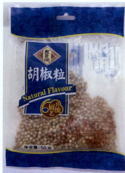
Figure 1. Unregistered NATURAL FLAVOR with Blue Label in Transparent Plastic Packaging (In Foreign Language)

The Food and Drug Administration (FDA) warns all healthcare professionals and the general public NOT TO PURCHASE AND CONSUME the following unregistered food products: