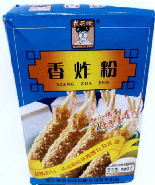
Figure 2. Unregistered GUIHUA SAO Xiang Zha Fen Blue Carton Box with Image of Fried Tempura (In Foreign Language)