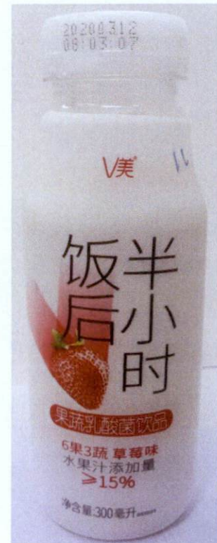
Figure 5. Unregistered Beverage in Clear Bottle with White Label with Image of Strawberry (In Foreign Language)