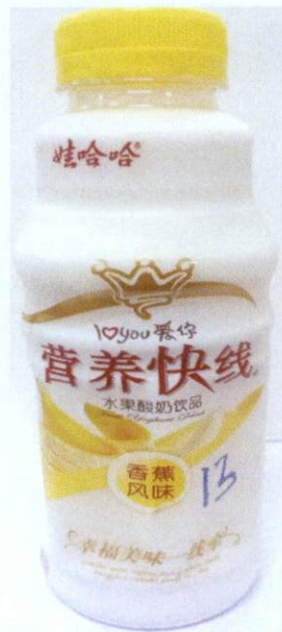
Figure 1. Unregistered Fruit Yoghurt Drink in Clear Plastic Bottle with White Label with Image of Banana (In Foreign Language)

The Food and Drug Administration (FDA) warns all healthcare professionals and the general public NOT TO PURCHASE AND CONSUME the following unregistered food products: