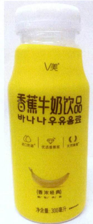
Figure 3. Unregistered Beverage in Clear Plastic Bottle with Yellow Label and Image of Banana (In Foreign Language)