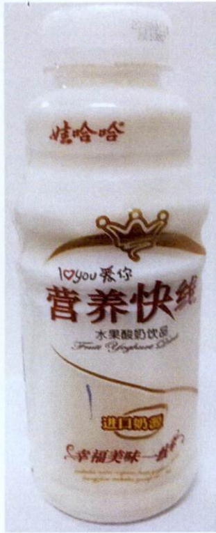
Figure 2. Unregistered Fruit Yoghurt Drink Beverage in Plastic Bottle with White Label (In Foreign Language)