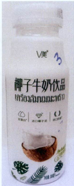
Figure 4. Unregistered Beverage in Clear Plastic Bottle with White Label and Image of Coconut (In Foreign Language)