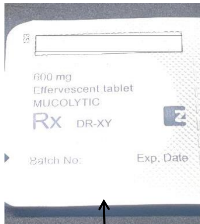
Light reflected from Camera Flash