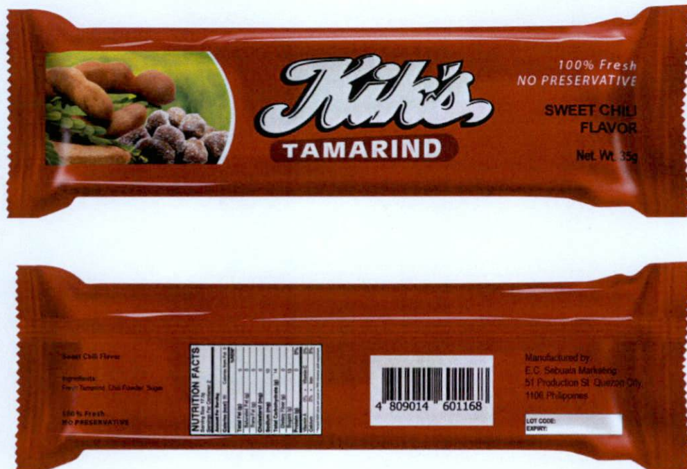
Figure 1. Approved label of KIK'S Tamarind Sweet Chili Flavor, FR-4000007507603 issued on 22 February 2021 valid until 22 February 2023 .