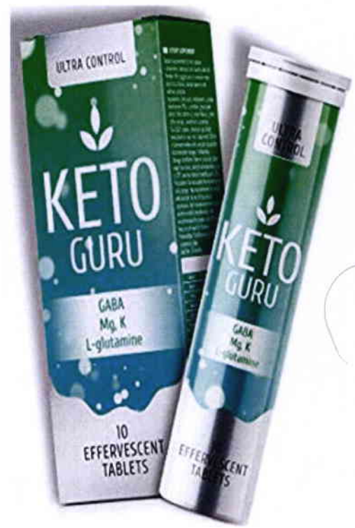
Figure 3. Unregistered KETO GURU GABA Mg, K, L-glutathione Dietary Supplement, 10 Effervescent Tablets