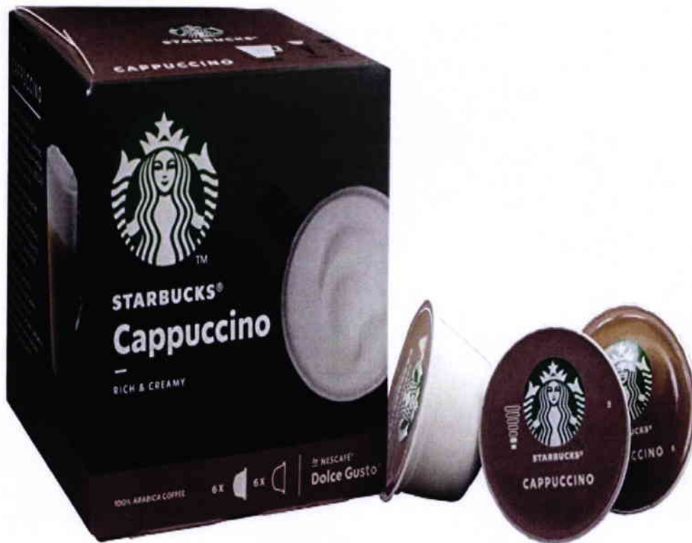
Figure 5. Unregistered STARBUCKS Cappuccino - Dolce Gusto, 220ml 12 Capsules (6 Cups)

The FDA verified through post-marketing surveillance that the abovementioned food supplements and food product are not registered and no corresponding Certificates of Product Registration (CPR) have been issued. Pursuant to the Republic Act No. 9711, otherwise known as the “Food and Drug Administration Act of 2009”, the manufacture, importation, exportation, sale, offering for sale, distribution, transfer, non-consumer use, promotion, advertising or sponsorship of health products without the proper authorization is prohibited.