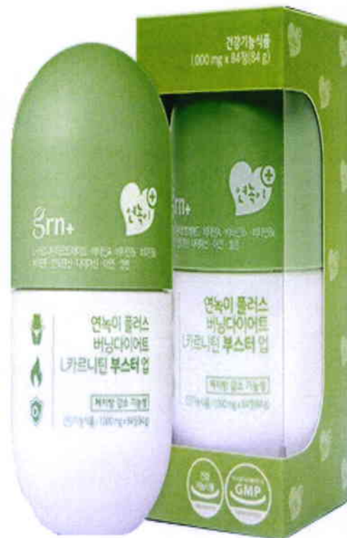
Figure 4. Unregistered GRN+ (in Pink and White container) and (in Green and White Container) (Labels are in foreign language)