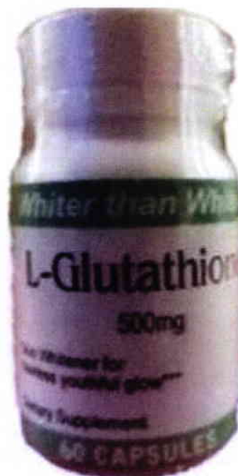
Figure 1. Unregistered WHITER THAN WHITE L-Glutathione 500mg Dietary Supplement, 60 Capsules

The Food and Drug Administration (FDA) warns all healthcare professionals and the general public NOT TO PURCHASE AND CONSUME the following unregistered food supplements and food product: