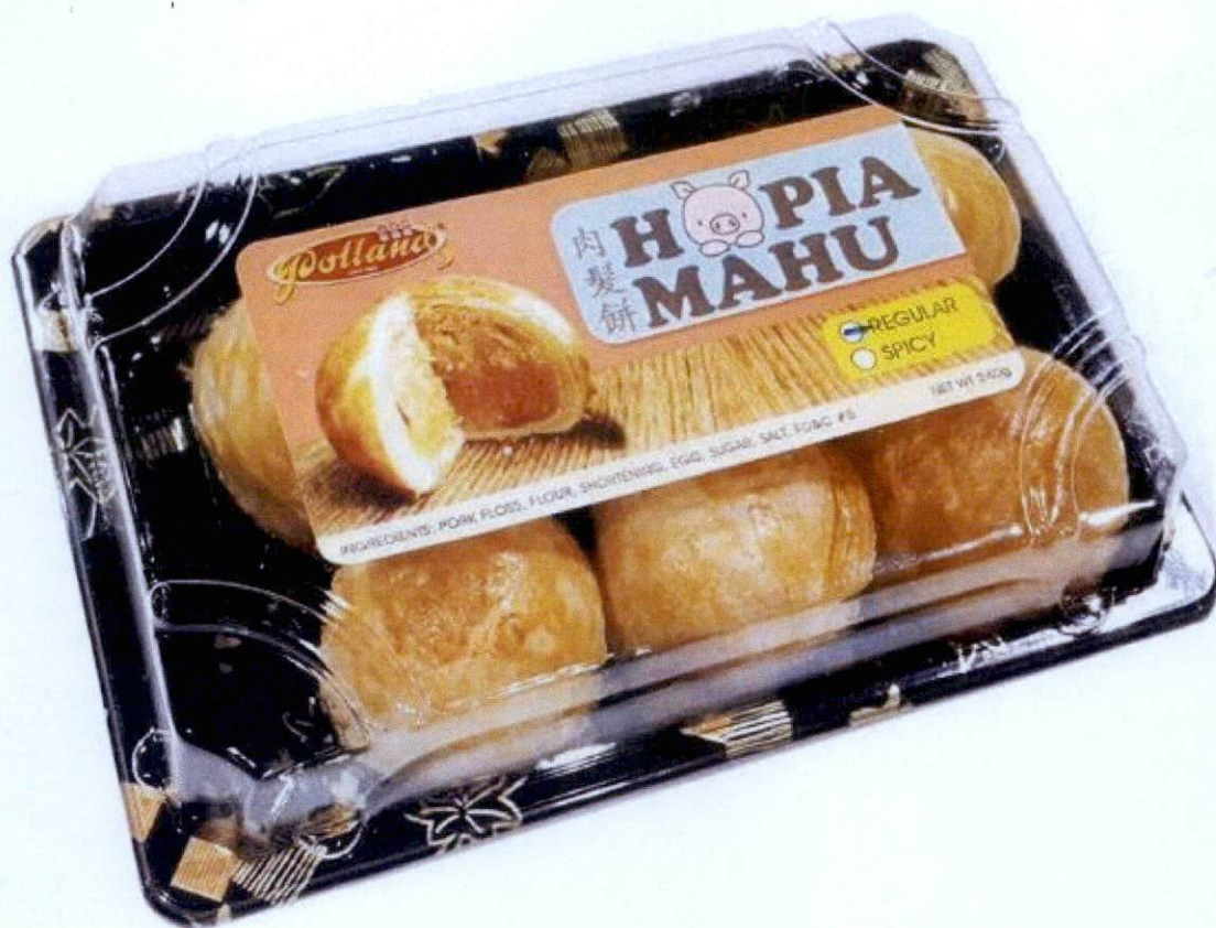
Figure 5. Unregistered POLLAND Hopia Mahu – Regular, 6pcs

The FDA verified through post-marketing surveillance that the abovementioned food supplement and food products are not registered and no corresponding Certificates of Product Registration (CPR) have been issued. Pursuant to the Republic Act No. 9711, otherwise known as the “Food and Drug Administration Act of 2009”, the manufacture, importation, exportation, sale, offering for sale, distribution, transfer, non-consumer use, promotion, advertising or sponsorship of health products without the proper authorization is prohibited.