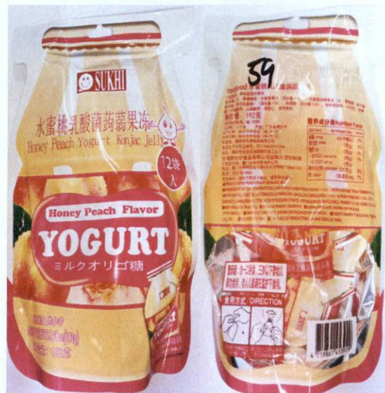
Figure 4. Unregistered SUKHI Honey Peach Yoghurt Konjac Jelly Barcode: 4719861453929 (Labels are in foreign Characters)