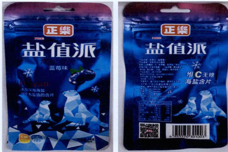
Figure 2. Unregistered HAIYAN – Berry (In violet to blue color packaging with pictures Sea Lion) Barcode: 6955170301003 (Labels are in foreign Characters)