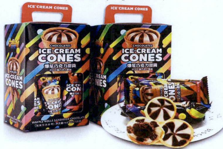
Figure 3. CAILUN Chocolate Ice Cream Cone Barcode: 497081070185 (Labels are in foreign Characters)