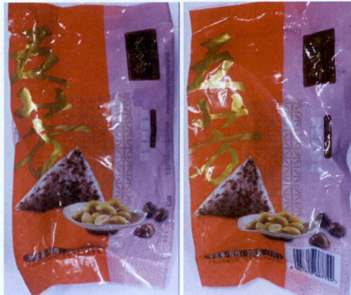
Figure 1. Unregistered Red and Purple Plastic with Rice Drawing and Chestnut Barcode: 6907619667744 (Labels are in foreign Characters)

The Food and Drug Administration (FDA) warns all healthcare professionals and the general public NOT TO PURCHASE AND CONSUME the following unregistered food products: