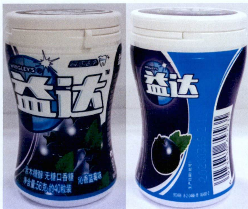
Figure 4. Unregistered WRIGLEY'S (with Blueberry drawing) Barcode: 6923450657935 (Labels are in foreign Characters)