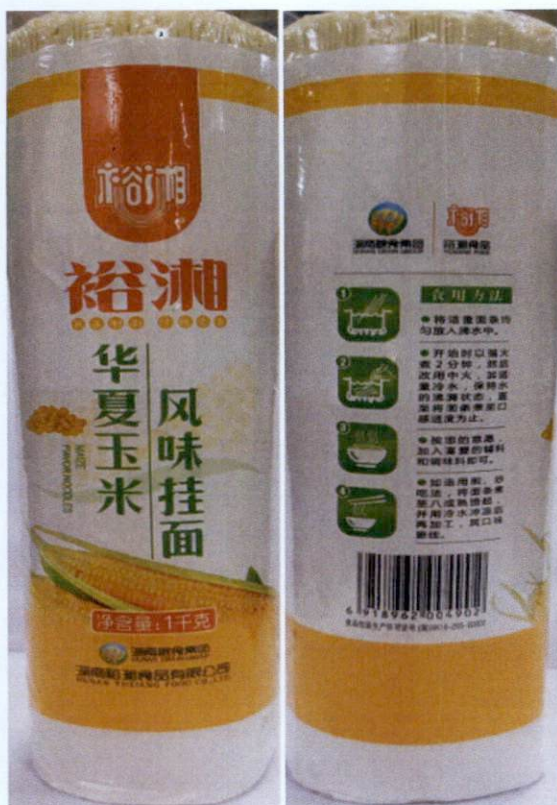
Figure 2. Unregistered HUNAN GRAIN GROUP Maize Flavor Noodle Barcode: 6918962004902 (Labels are in foreign Characters)