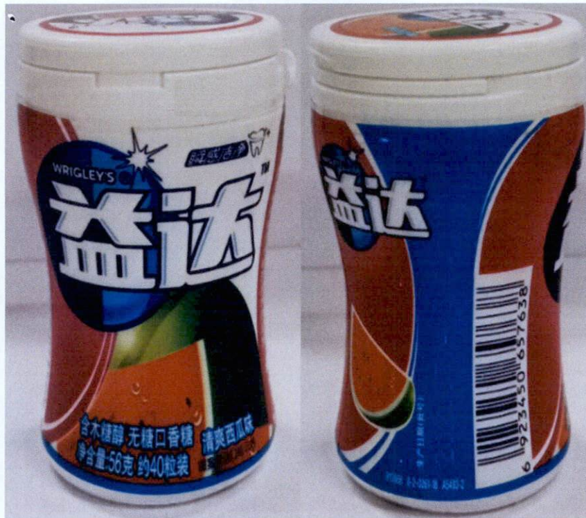
Figure 5. Unregistered WRIGLEY'S (with Watermelon drawing) Barcode: 6923450657638 (Labels are in foreign Characters)

The FDA verified through post-marketing surveillance that the abovementioned food products are not registered and no corresponding Certificates of Product Registration (CPR) have been issued. Pursuant to the Republic Act No. 9711, otherwise known as the “Food and Drug Administration Act of 2009”, the manufacture, importation, exportation, sale, offering for sale, distribution, transfer, non-consumer use, promotion, advertising or sponsorship of health products without the proper authorization is prohibited.