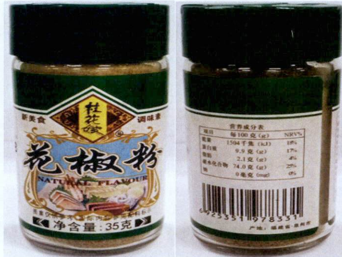
Figure 3. Unregistered Small green bottle container with “NATURAL FLAVOUR” (Pepper Powder) Barcode: 6925351978331 (Labels are in foreign Characters)