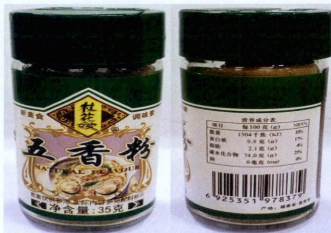
Figure 1. Unregistered Small green bottle container with “NATURAL FLAVOUR” (Five Spice Powder) Barcode: 6925351978379 (Labels are in foreign Characters)

The Food and Drug Administration (FDA) warns all healthcare professionals and the general public NOT TO PURCHASE AND CONSUME the following unregistered food products: