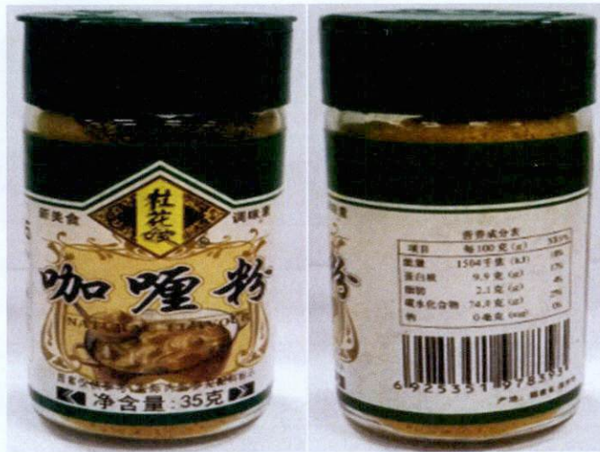
Figure 2. Unregistered Small green bottle container with “NATURAL FLAVOUR” (Curry Powder) Barcode: 6925351978393 (Labels are in foreign Characters)