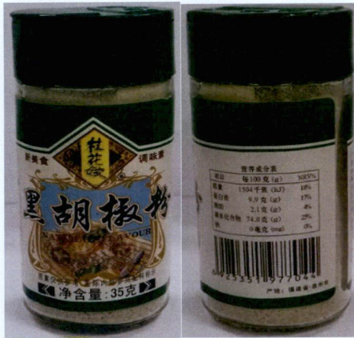
Figure 5. Unregistered Small green bottle container with “NATURAL FLAVOUR” (Black Pepper Powder) Barcode; 6925351977044 (Labels are in foreign Characters)

The FDA verified through post-marketing surveillance that the abovementioned food products are not registered and no corresponding Certificates of Product Registration (CPR) have been issued. Pursuant to the Republic Act No. 9711, otherwise known as the “Food and Drug Administration Act of 2009”, the manufacture, importation, exportation, sale, offering for sale, distribution, transfer, non-consumer use, promotion, advertising or sponsorship of health products without the proper authorization is prohibited.