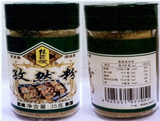
Figure 4. Unregistered Small green bottle container with “NATURAL FLAVOUR” (Cumin Powder) Barcode: 6925351977051 (Labels are in foreign Characters)