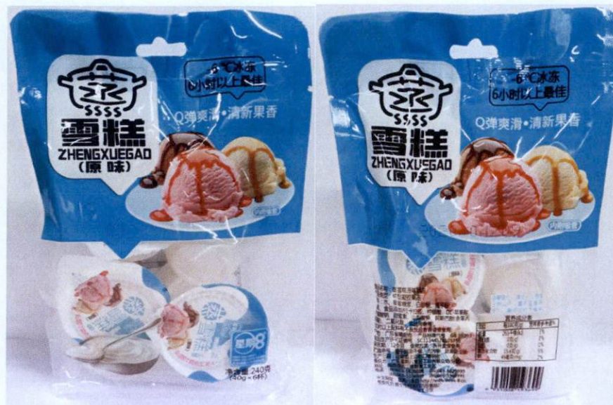
Figure 1. Unregistered ZHENGXUEGAO (in plastic pouch with ice cream drawing) Barcode: 6931008193699 (Labels are in foreign Characters)

The Food and Drug Administration (FDA) warns all healthcare professionals and the general public NOT TO PURCHASE AND CONSUME the following unregistered food products: