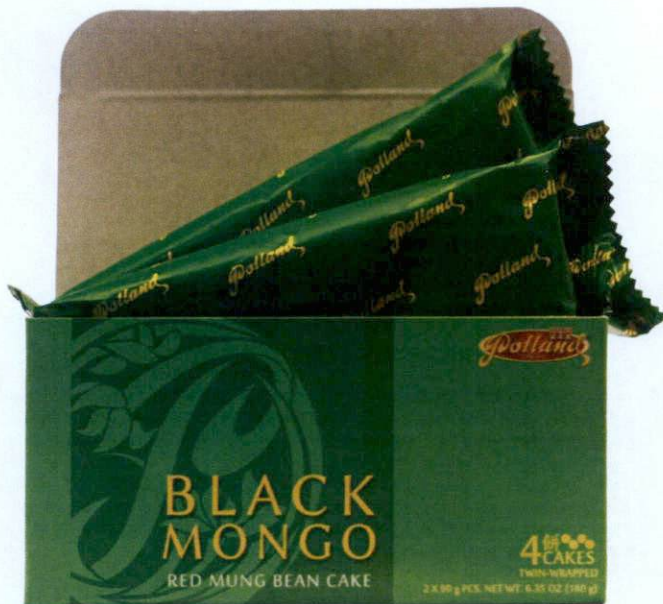
Figure 2. Unregistered POLLAND Hopia Black Mongo – Red Mung Bean Cake, 2x90g pcs. Net Wt. 6.35oz (180g)