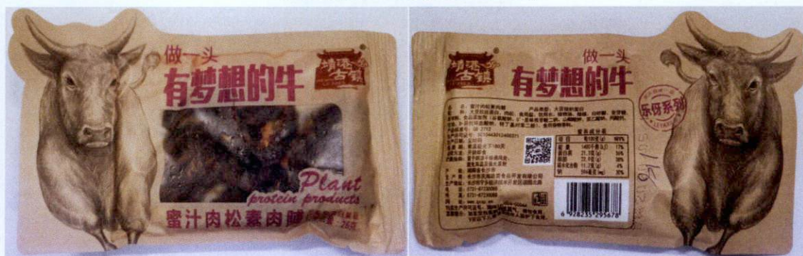
Figure 4. Unregistered JIN GANG GU ZHEN Plant Protein Products (in color Violet characters) Barcode: 6928235295678 (Labels are in foreign Characters)