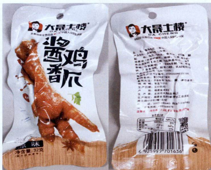
Figure 3. Unregistered DA CHENG (in white and brown vacuumed pouch with Chicken Feet drawing) Barcode: 692599701636 (Labels are in foreign Characters)