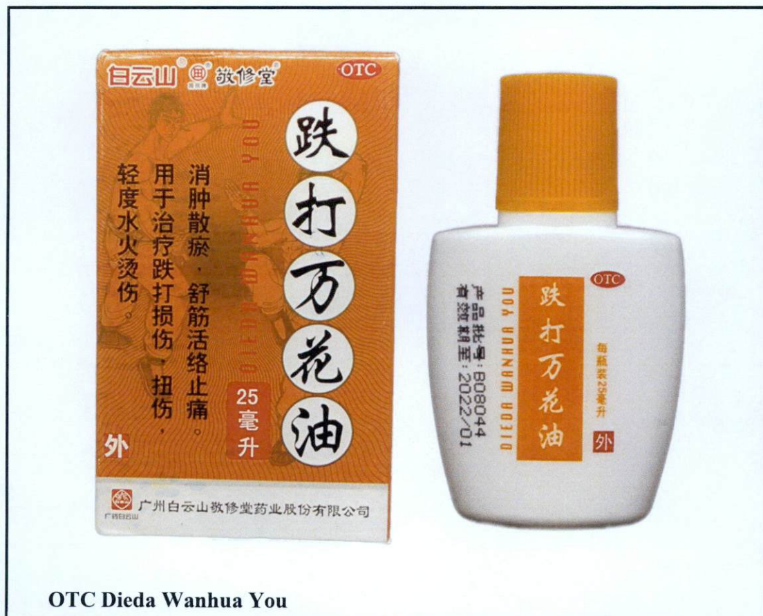
OTC Dieda Wanhua You

The Food and Drug Administration (FDA) advises the public against the purchase and use of the following unregistered drug products: