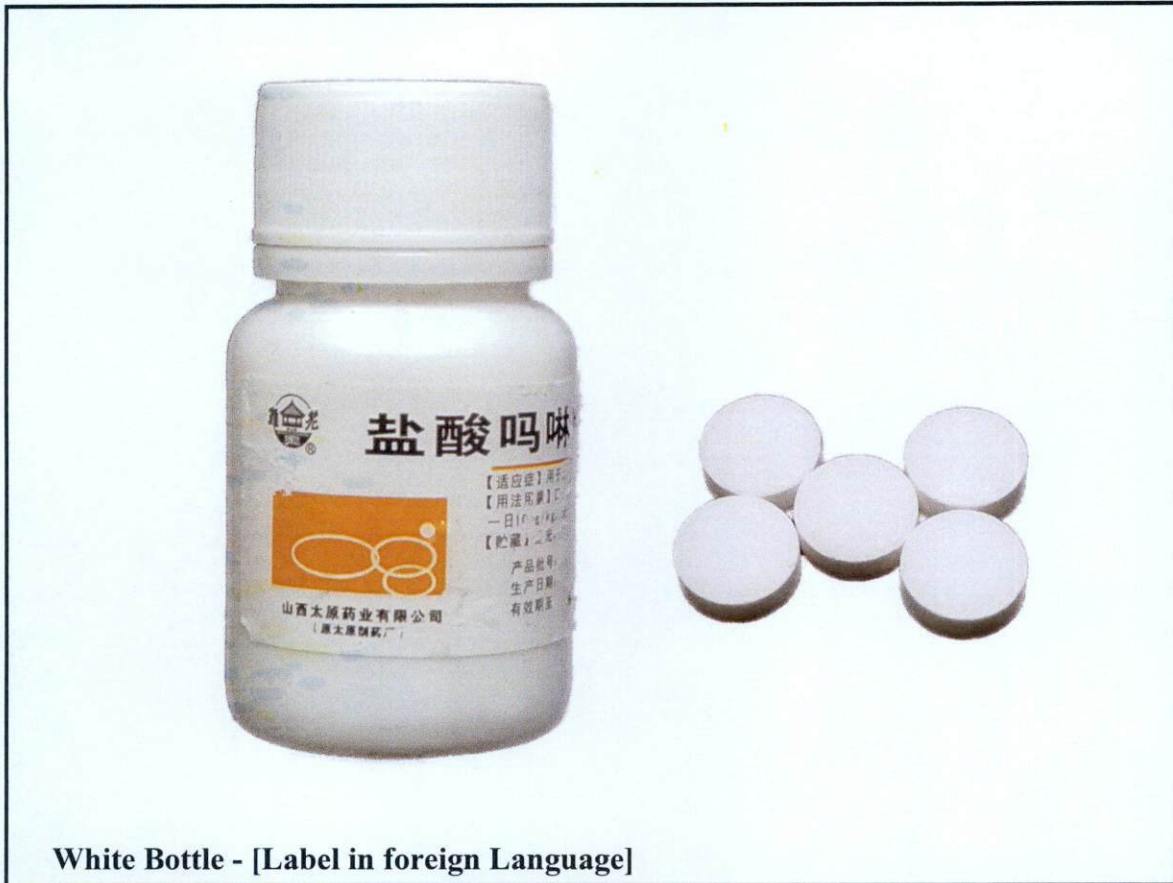
White Bottle - [Label in foreign Language]