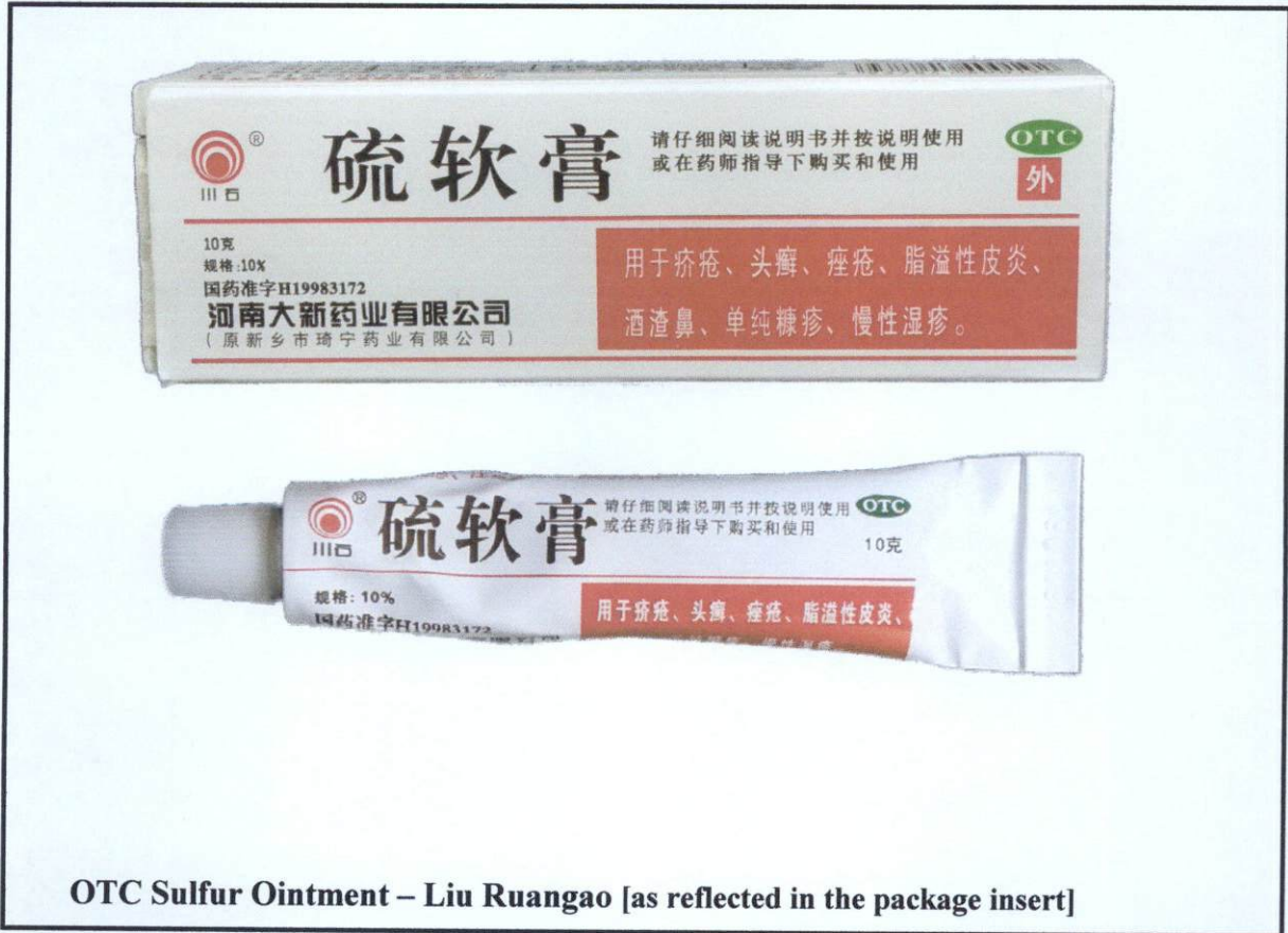
Figure 3. Unregistered drug product