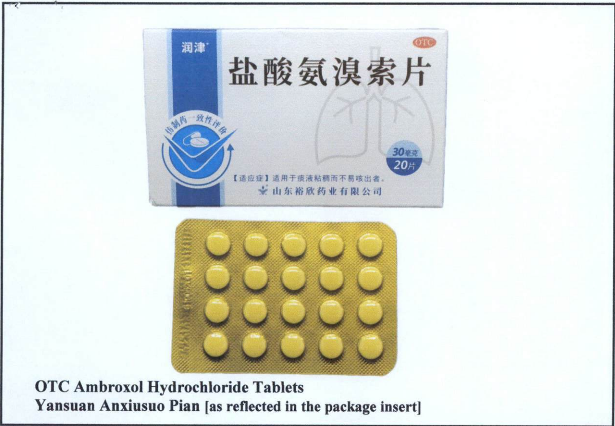
Figure 2. Unregistered drug product