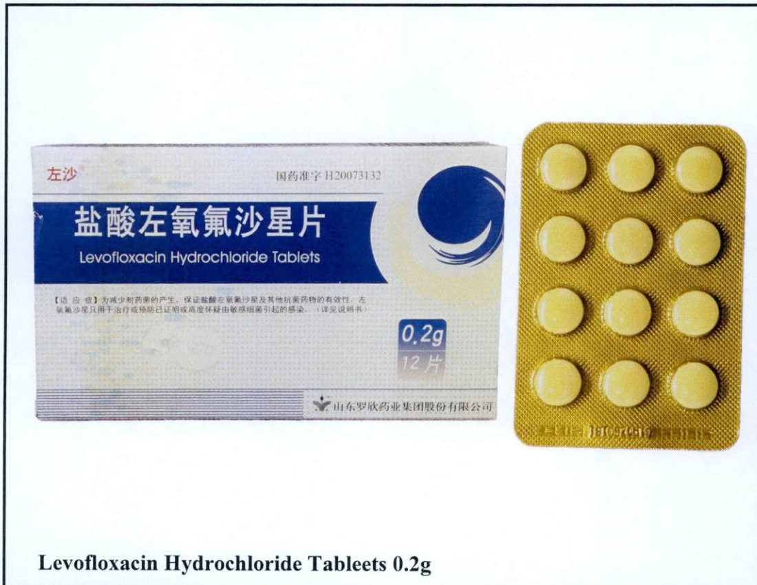
Levofloxacin Hydrochloride Tablets 0.2g

The Food and Drug Administration (FDA) advises the public against the purchase and use of the following unregistered drug products: