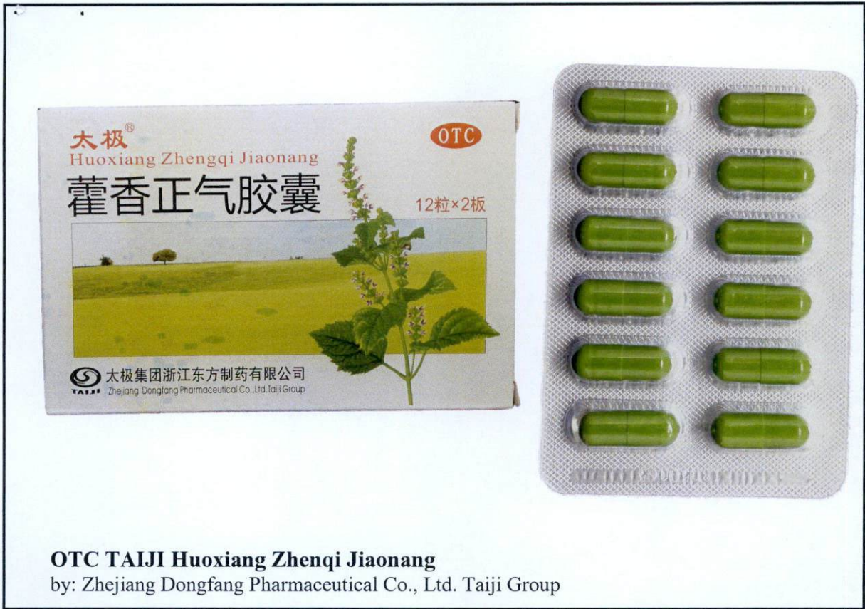
OTC TAIJI Huoxiang Zhenqi Jiaonang by: Zhejiang Dongfang Pharmaceutical Co., Ltd. Taiji Group