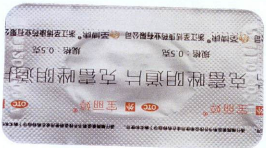
OTC Clotrimazole Vaginal Tablets – Kemeizuo Yindaopian by: Subkom®