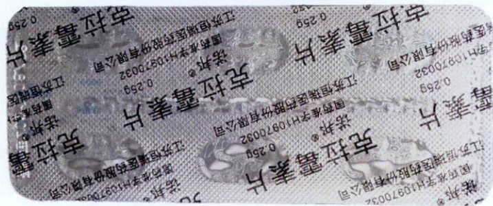
Clarithromycin Tablets 0.25g