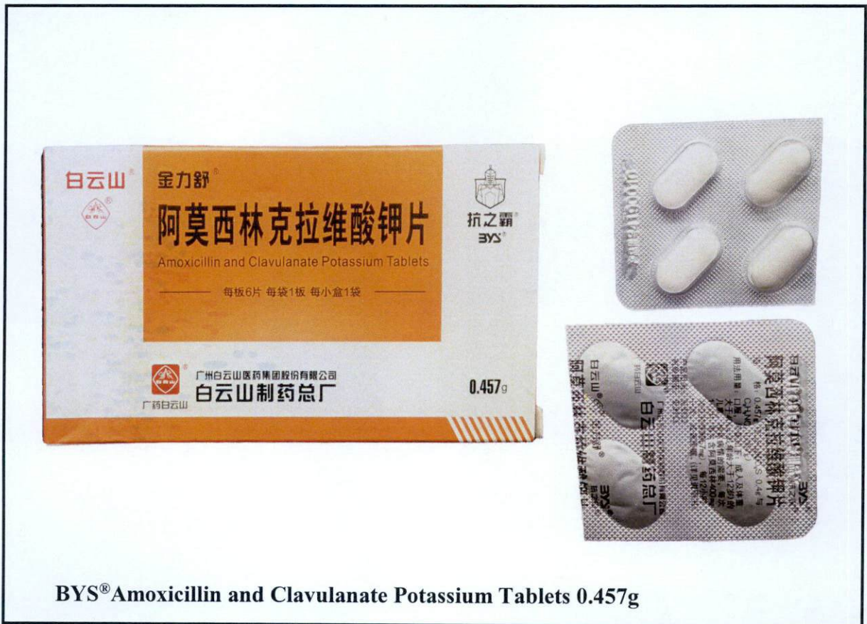
BYS® Amoxicillin and Clavulanate Potassium Tablets 0.457g