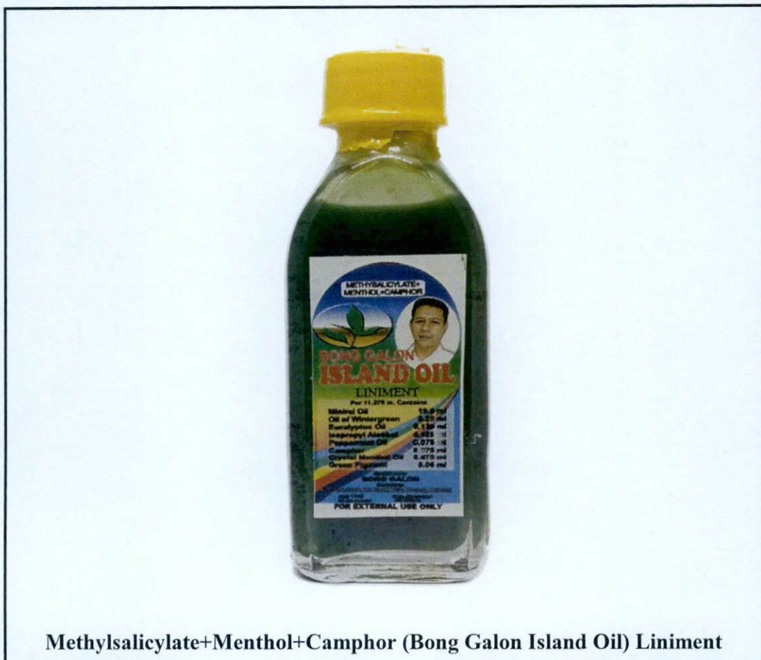
Methylsalicylate+Menthol+Camphor (Bong Galon Island Oil) Liniment

The Food and Drug Administration (FDA) advises the public against the purchase and use of the unregistered drug product: