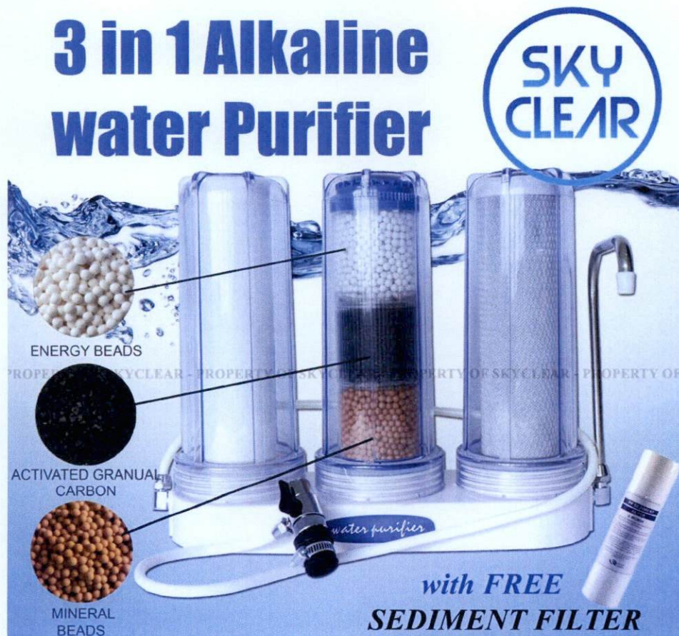
Figure 1. Unregistered SkyClear® 3 in 1 Alkaline Water Purifier with Free Sediment Filter

The Food and Drug Administration (FDA) warns the general public NOT TO PURCHASE AND USE the unregistered health-related device product: