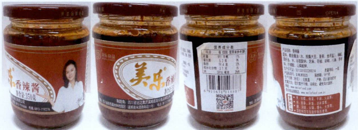
Figure 3. Unregistered MEILI FOOD (Chili Paste in Red packaging) (Labels are in foreign characters)