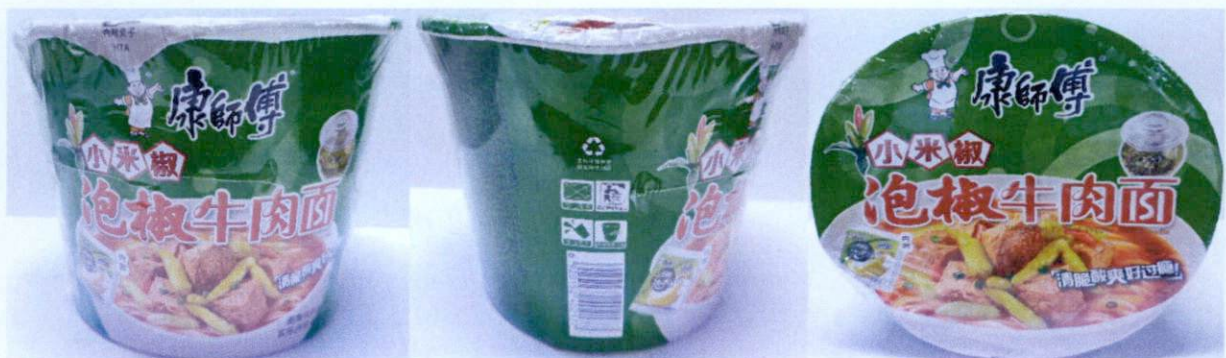
Figure 4. Unregistered Cup noodles Pickled Pepper Beef Noodles (Labels are in foreign characters)