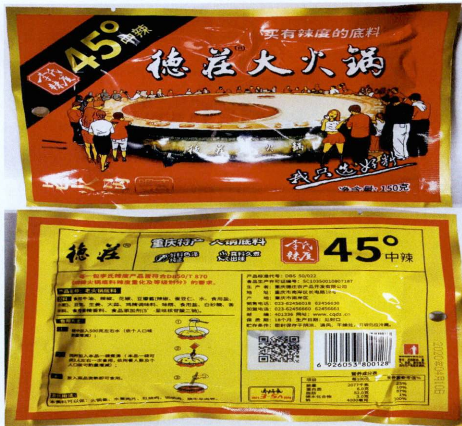
Figure 5. Unregistered Red and Yellow Foil Pouch (Labels are in foreign characters)

The FDA verified through post-marketing surveillance that the abovementioned food products are not registered and no corresponding Certificates of Product Registration (CPR) have been issued. Pursuant to the Republic Act No. 9711, otherwise known as the “Food and Drug Administration Act of 2009”, the manufacture, importation, exportation, sale, offering for sale, distribution, transfer, non-consumer use, promotion, advertising or sponsorship of health products without the proper authorization is prohibited.