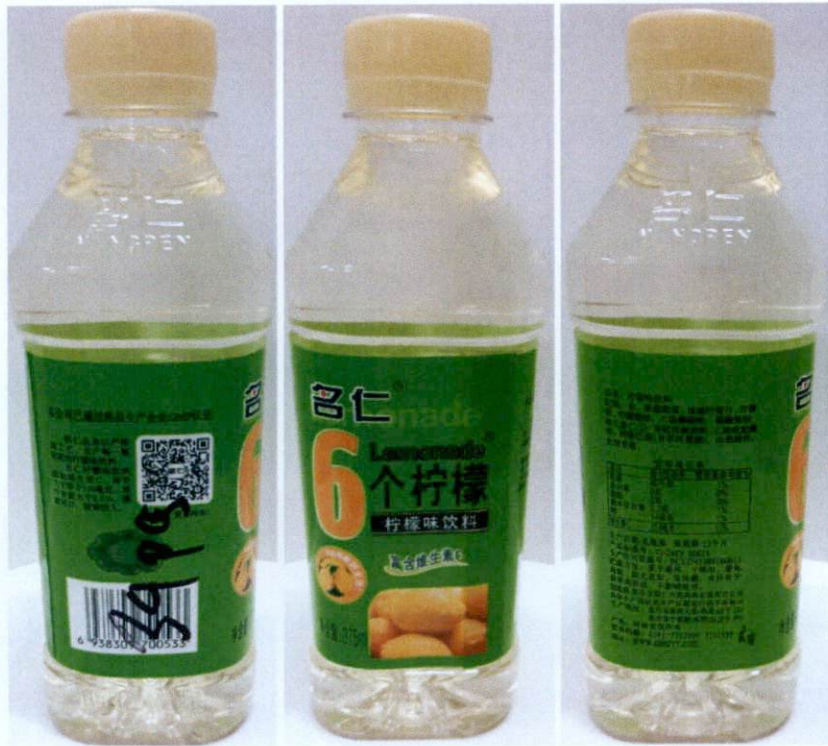
Figure 2. Unregistered LEMONADE 6 in Green Packaging (Plastic Bottle) 375ml, (Labels are in foreign characters)