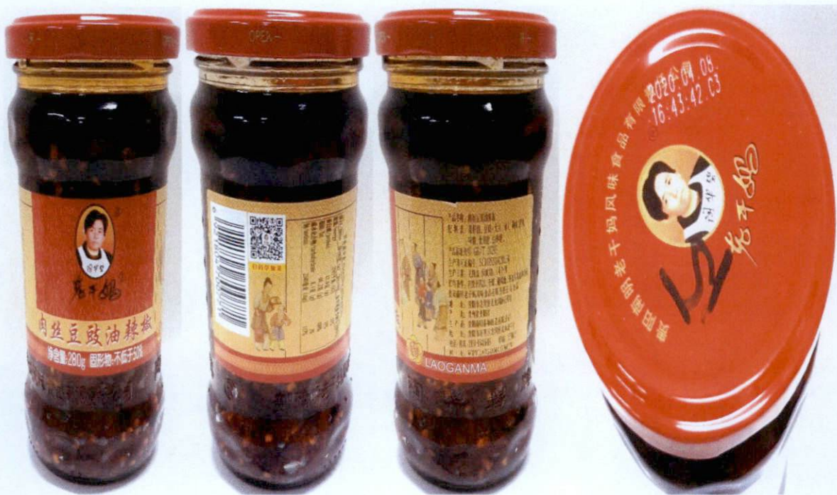
Figure 1. Unregistered LAOGANMA in Red Packaging (in Glass Jar) 280g (Labels are in foreign characters)

The Food and Drug Administration (FDA) warns all healthcare professionals and the general public NOT TO PURCHASE AND CONSUME the following unregistered food products: