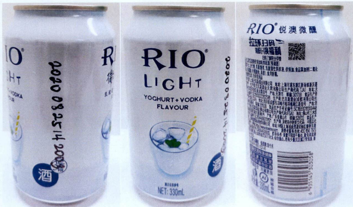
Figure 5. Unregistered RIO LIGHT Yoghurt + Vodka Flavour, 330ml

The FDA verified through post-marketing surveillance that the abovementioned food products are not registered and no corresponding Certificates of Product Registration (CPR) have been issued. Pursuant to the Republic Act No. 9711, otherwise known as the “Food and Drug Administration Act of 2009”, the manufacture, importation, exportation, sale, offering for sale, distribution, transfer, non-consumer use, promotion, advertising or sponsorship of health products without the proper authorization is prohibited.