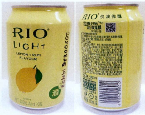
Figure 3. Unregistered RIO LIGHT Lemon + Rum Flavour, 330ml