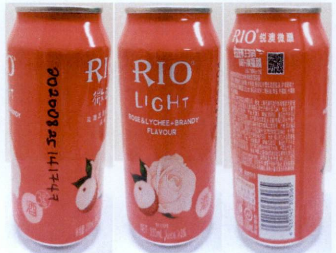
Figure 4. Unregistered RIO LIGHT Rose & Lychee + Brandy Flavour, 330ml