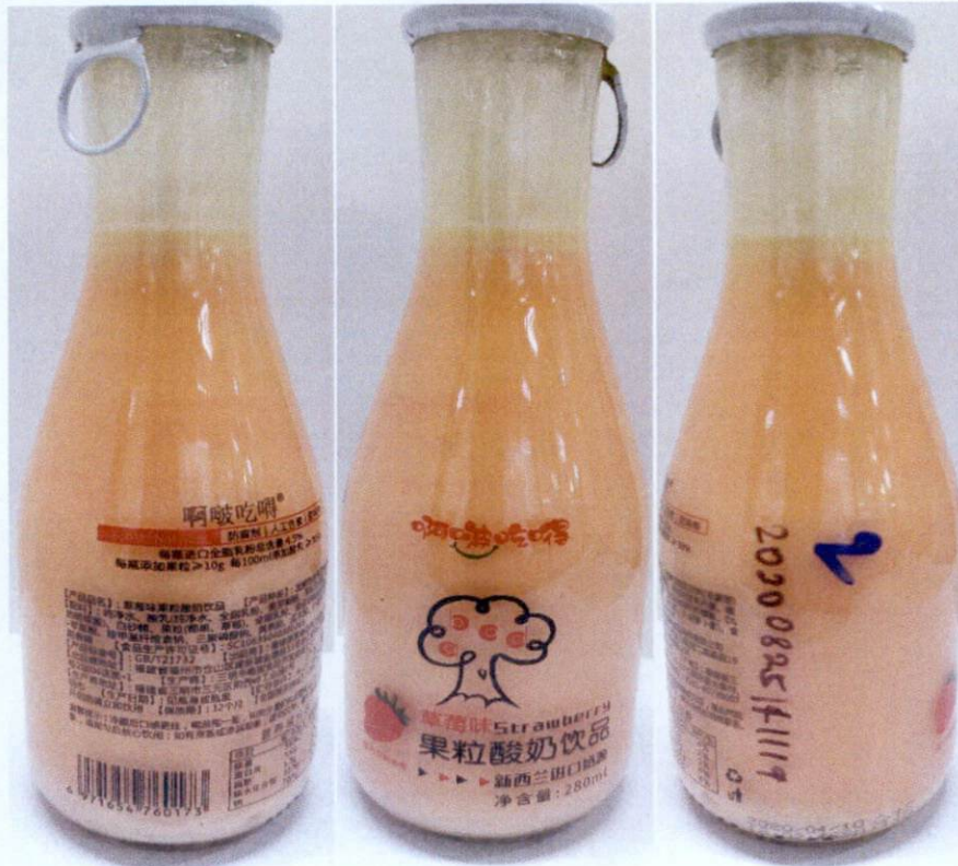
Figure 2. Unregistered Strawberry Liquid in Glass Bottle, 280ml (Labels are in foreign characters)