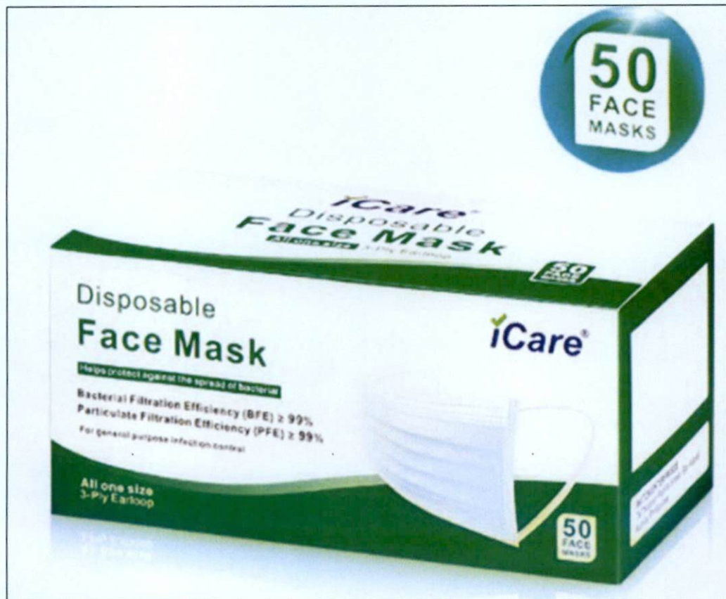
Figure 1. Unnotified iCare® Disposable Face Mask

The Food and Drug Administration (FDA) warns all healthcare professionals and the general public NOT TO PURCHASE AND USE the unnotified medical device product: