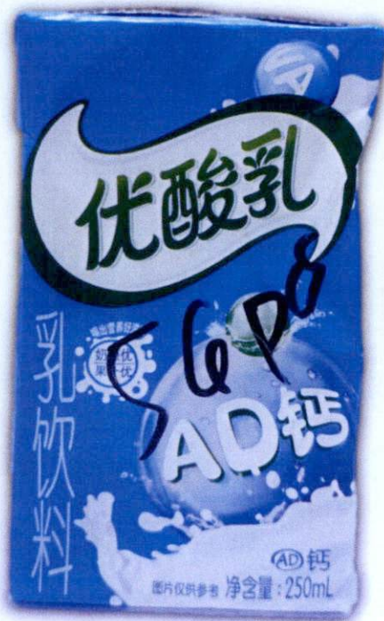
Figure 4. Unregistered Drink in Blue and White Tetra Pack (In Foreign Language)