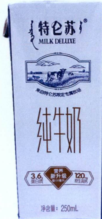
Figure 1. Unregistered Milk Deluxe White Colored Tetra Pack (In Foreign Language)

The Food and Drug Administration (FDA) warns all healthcare professionals and the general public NOT TO PURCHASE AND CONSUME the following unregistered food products: