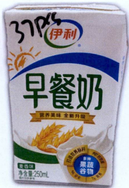
Figure 2. Unregistered Drink in White Tetra Pack with Image of Wheat and Milk (In Foreign Language)