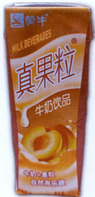
Figure 3. Unregistered Milk Beverage in Orange and Brown Colored Tetra Pack (In Foreign Language)