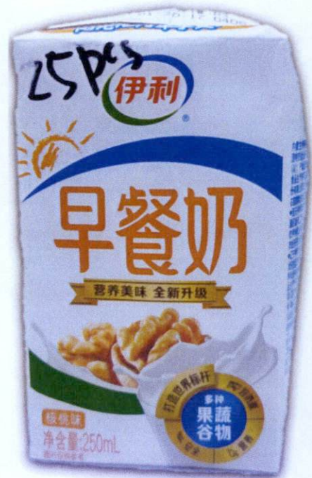
Figure 5. Unregistered Milk Drink in White Tetra Pack with Image of Walnut and Milk (In Foreign Language)