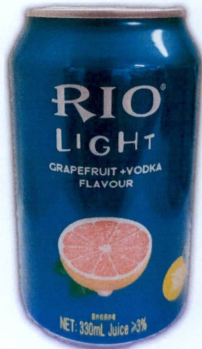
Figure 5. Unregistered RIO Light Grapefruit Vodka Flavor (In Foreign Language)