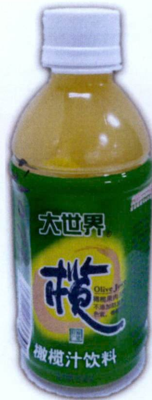
Figure 3. Unregistered Olive Juice (In Foreign Language)