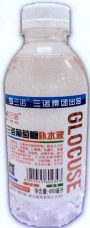
Figure 4. Unregistered Glucose (in Red Font) Drink in Clear Plastic Bottle with White Cap (In Foreign Language)