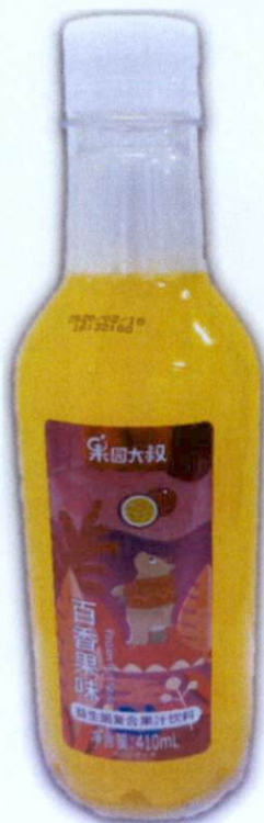
Figure 1. Unregistered Passion Fruit Yellow Colored Juice Drink in Clear Plastic Bottle (In Foreign Language)

The Food and Drug Administration (FDA) warns all healthcare professionals and the general public NOT TO PURCHASE AND CONSUME the following unregistered food products: