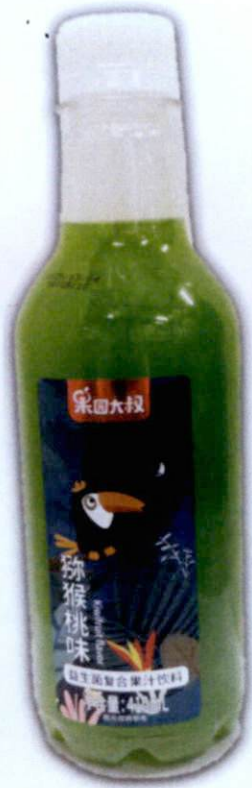
Figure 2. Unregistered Kiwi Fruit Flavored Green Colored Juice Drink in Clear Plastic Bottle (In Foreign Language)