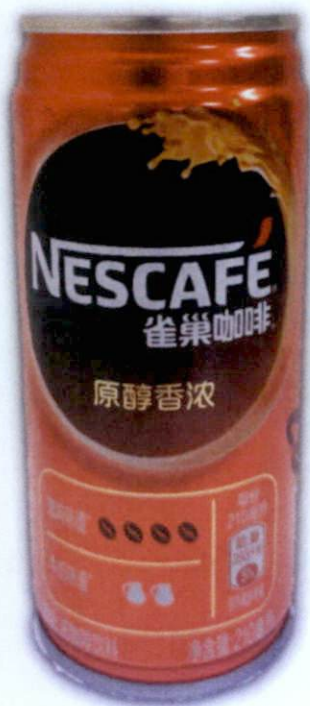
Figure 4. Unregistered NESCAFE in Red Can (In Foreign Language)