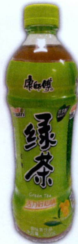
Figure 3. Unregistered Green Tea in Plastic Bottle with Green Colored Label (In Foreign Language)