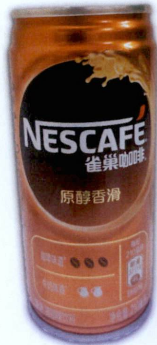
Figure 5. Unregistered NESCAFE in Brown Can (In Foreign Language)