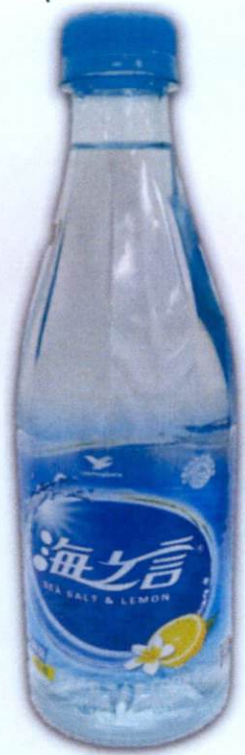
Figure 2. Unregistered Plastic Bottle with Blue Label Sea Salt & Lemon (In Foreign Language)