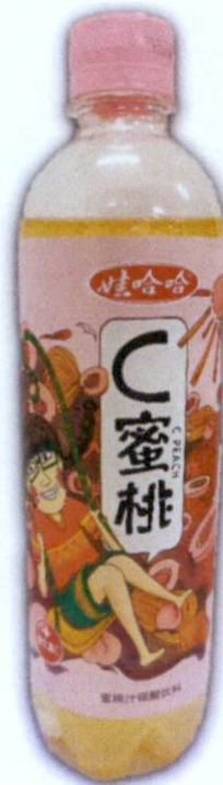
Figure 1. Unregistered C Peach in Clear Plastic Bottle with Pink Colored Label (In Foreign Language)

The Food and Drug Administration (FDA) warns all healthcare professionals and the general public NOT TO PURCHASE AND CONSUME the following unregistered food products: