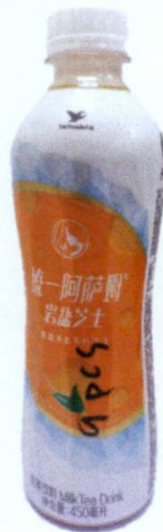
Figure 1. Unregistered Milk Tea Drink in Transparent Bottle with White and Orange Label (In Foreign Language)

The Food and Drug Administration (FDA) warns all healthcare professionals and the general public NOT TO PURCHASE AND CONSUME the following unregistered food products: