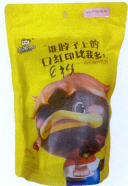
Figure 5. Unregistered Food Product in Yellow Resealable Plastic Bag with Image of Duck (In Foreign Language)