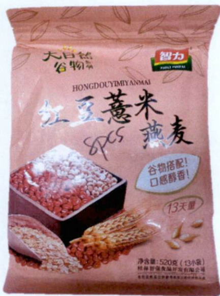
Figure 4. Unregistered HONGDOUYIMIANMAI Resealable Plastic Packaging with Images of Legumes, Wheat and Oats (In Foreign Language)