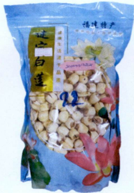
Figure 3. Unregistered Food Product in Sky Blue Resealable Plastic Packaging with Image of Lotus (In Foreign Language)