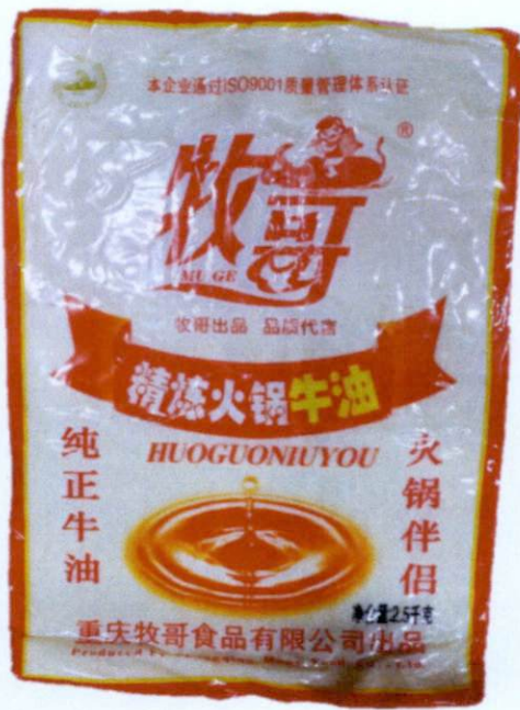
Figure 2. Unregistered HOUQUONIUYOU Lard in Vacuumed Plastic Packaging (In Foreign Language)