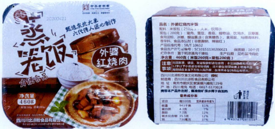
Figure 4. Unregistered Rice Meal in a Black colored Tub with White and Red colored Label (Labels are in foreign characters)