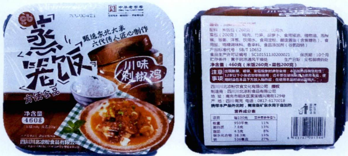
Figure 3. Unregistered Rice Meal in a Black colored Tub with White and Violet colored Label (Labels are in foreign characters)