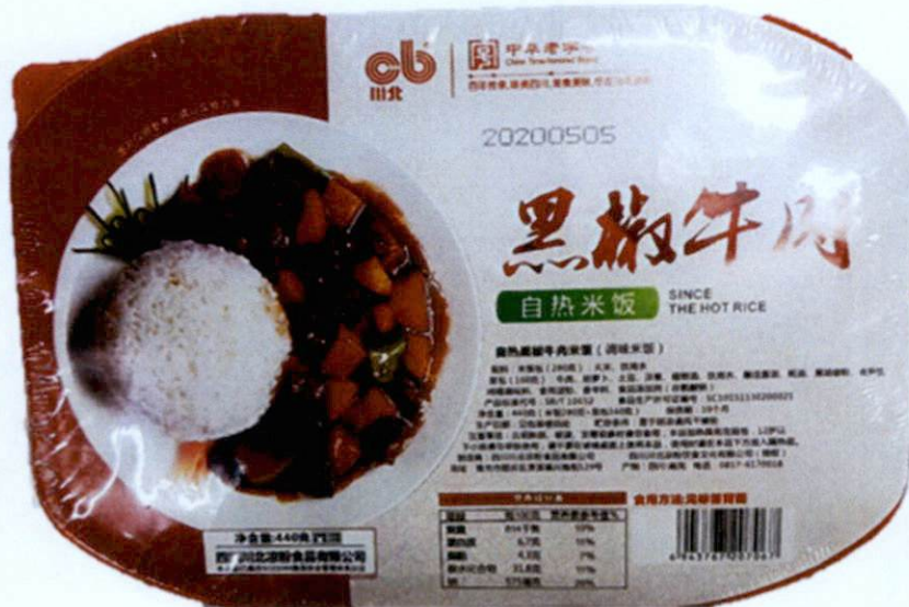
Figure 5. Unregistered Rice Meal in Red colored Tub with White and Red Label (Labels are in foreign characters)

The FDA verified through post-marketing surveillance that the abovementioned food products are not registered and no corresponding Certificates of Product Registration (CPR) have been issued. Pursuant to the Republic Act No. 9711, otherwise known as the “Food and Drug Administration Act of 2009”, the manufacture, importation, exportation, sale, offering for sale, distribution, transfer, non-consumer use, promotion, advertising or sponsorship of health products without the proper authorization is prohibited.