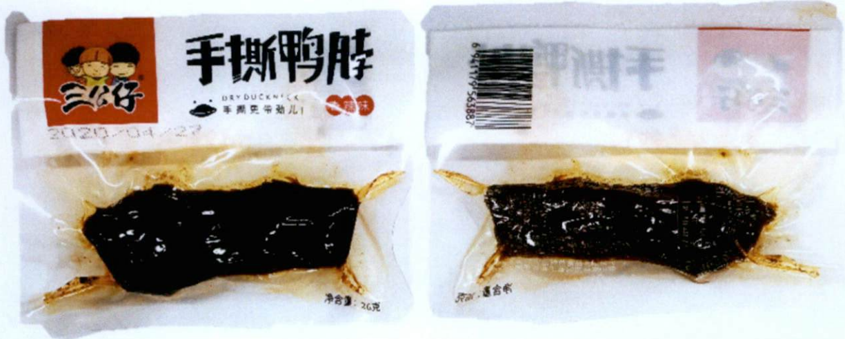
Figure 2. Unregistered Dry Duck Neck (in a clear vacuum pouch with red and white-colored label) (Labels are in foreign characters)