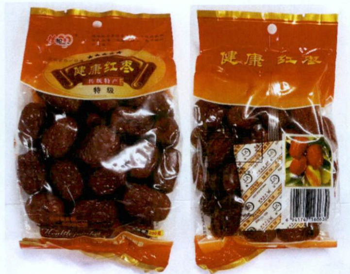
Figure 1. Unregistered MENGXIANGSI Health Jujube (in clear plastic pack with orange-colored label) (Labels are in foreign characters)

The Food and Drug Administration (FDA) warns all healthcare professionals and the general public NOT TO PURCHASE AND CONSUME the following unregistered food products: