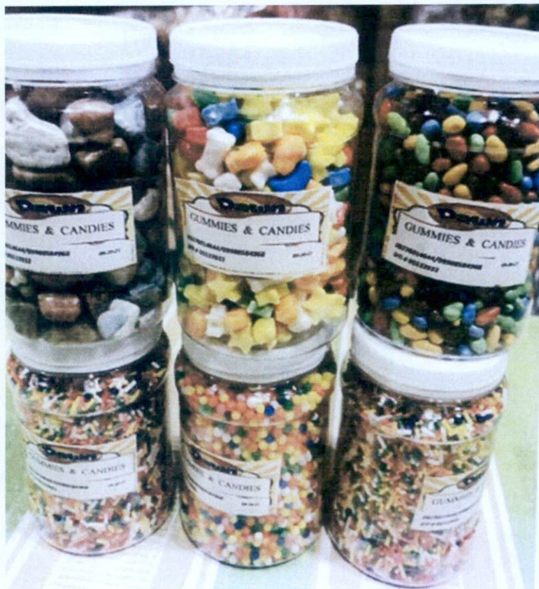
Figure 1. Unregistered DAWN Gummies Candies

The Food and Drug Administration (FDA) warns all healthcare professionals and the general public NOT TO PURCHASE AND CONSUME the following unregistered food products: