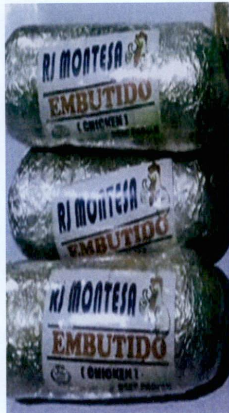
Figure 3. Unregistered RJ MONTESA Embutido – Chicken