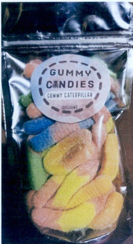
Figure 4. Unregistered GUMMY CANDIES Gummy Caterpillar, 100grams