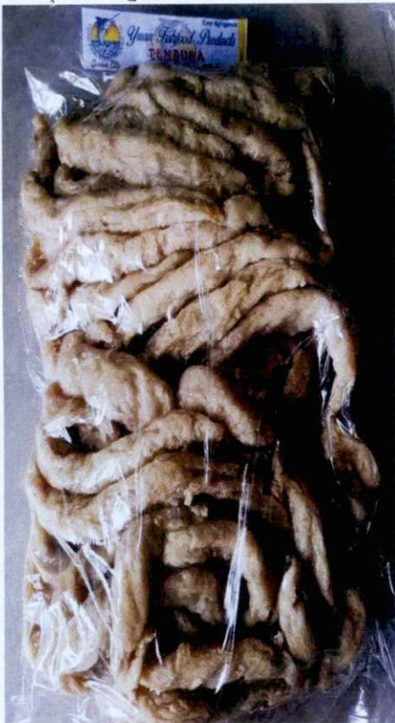
Figure 2. Unregistered YUAN FISH FOOD PRODUCTS Tuna Tempura