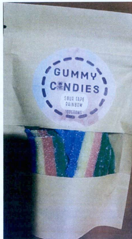
Figure 5. Unregistered GUMMY CANDIES Sour Tape Rainbow, 100grams