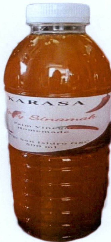
Figure 1. Unregistered KARASA Spicy Sinamak, 575ml

The Food and Drug Administration (FDA) warns all healthcare professionals and the general public NOT TO PURCHASE AND CONSUME the following unregistered food products: