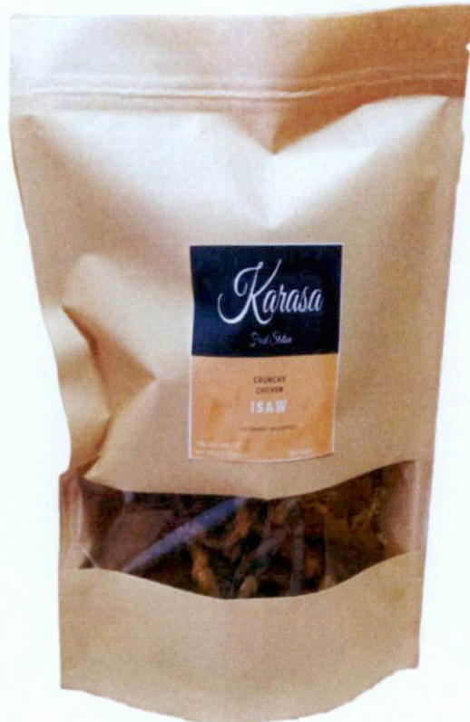
Figure 4. Unregistered KARASA Crunchy Chicken Isaw

The FDA verified through post-marketing surveillance that the abovementioned food products are not registered and no corresponding Certificates of Product Registration (CPR) have been