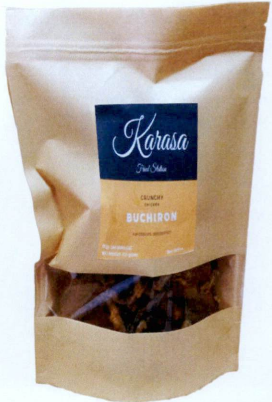
Figure 3. Unregistered KARASA Crunchy Buchiron