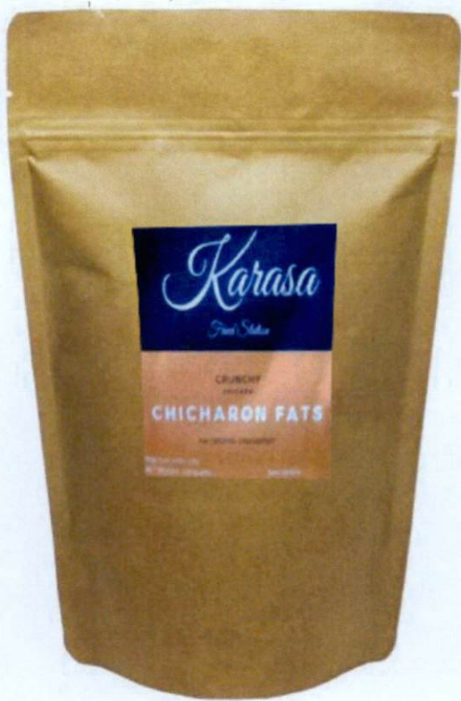
Figure 2. Unregistered KARASA Crunchy Chicharon Fats