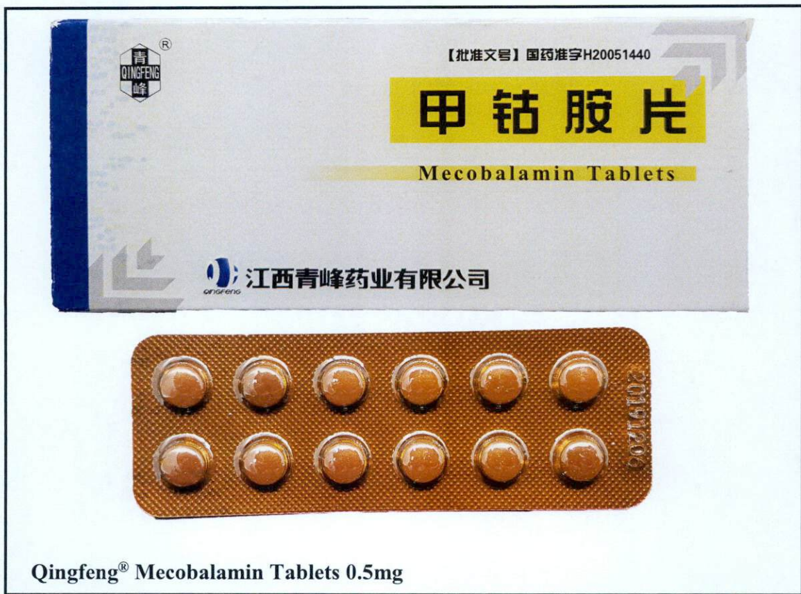
Qingfeng® Mecobalamin Tablets 0.5mg