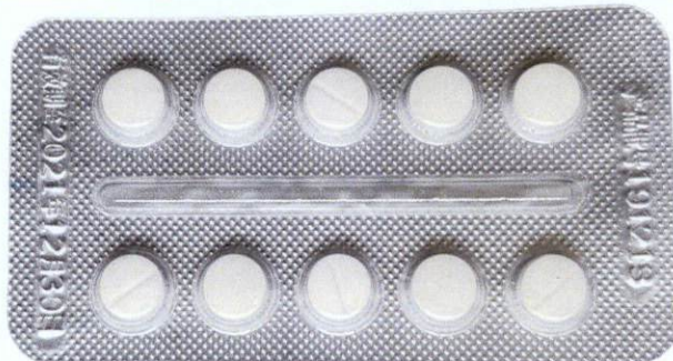
Ebastine Tablets 10's