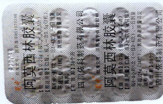
Amoxicillin Capsules- Amoxicillin Jiaonang 0.25g [as reflected in the package insert]