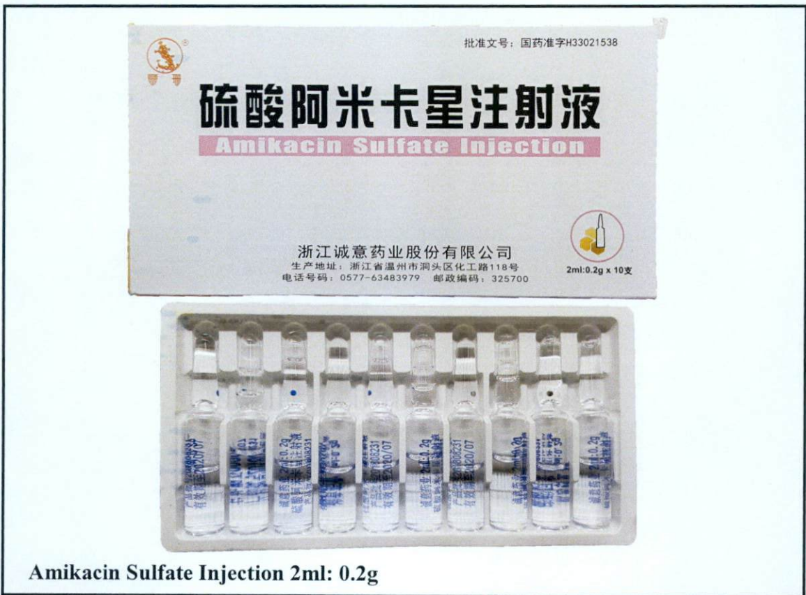
Figure 5. Unregistered drug product