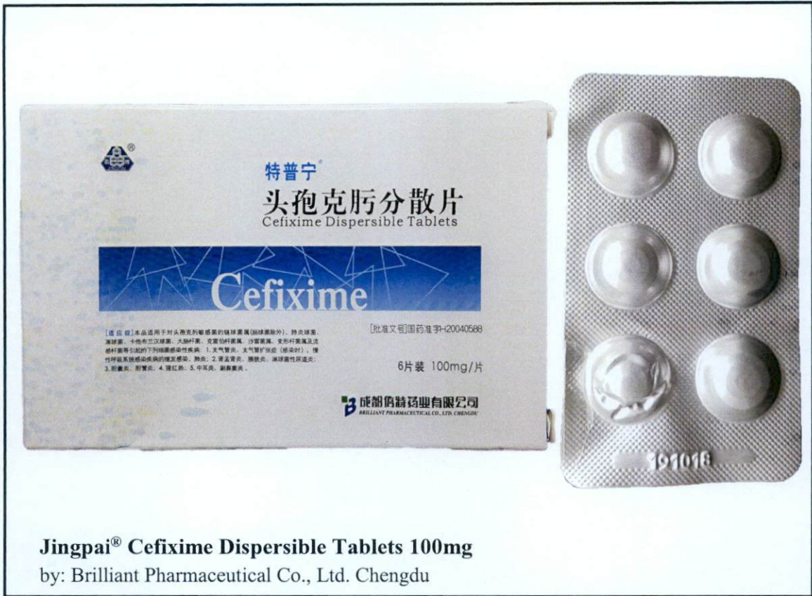
Figure 4. Unregistered drug product