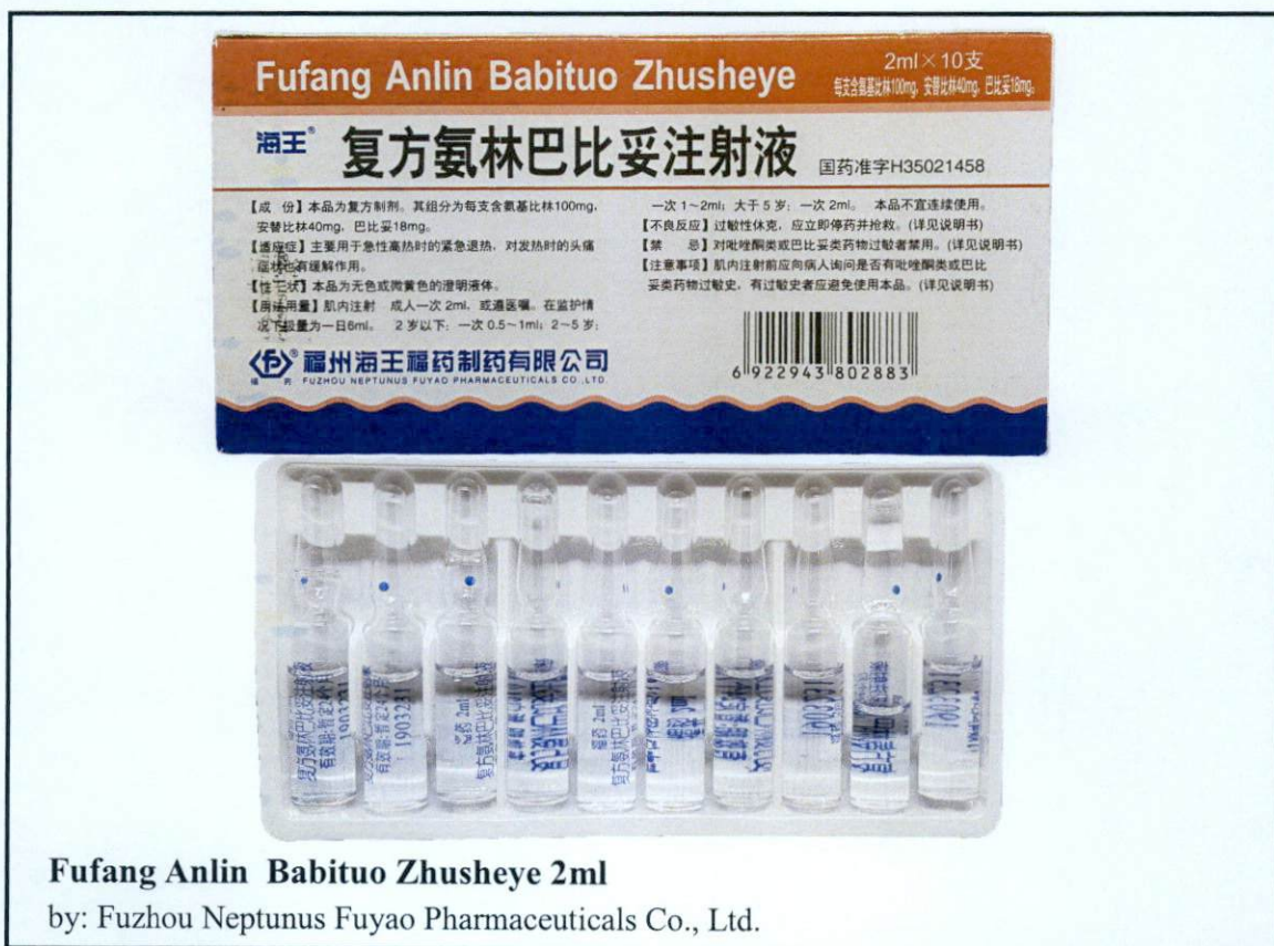
Fufang Anlin Babbituo Zhusheyeye 2ml