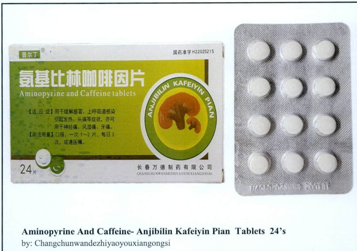
Aminopyrine And Caffeine- Anjibilin Kafeiyin Pian Tablets 24's by: Changchunwandezhiyaoyouxiangongsi