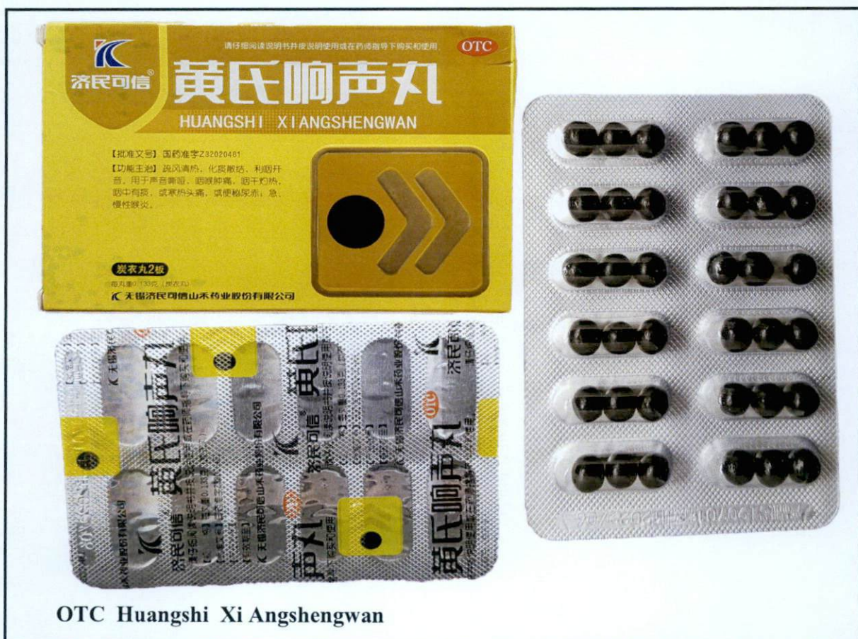
OTC Huangshi Xi Angshengwan