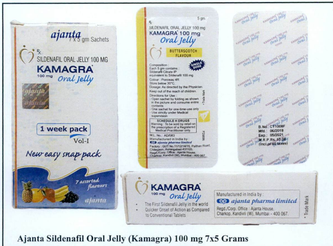
Ajanta Sildenafil Oral Jelly (Kamagra) 100 mg 7x5 Grams