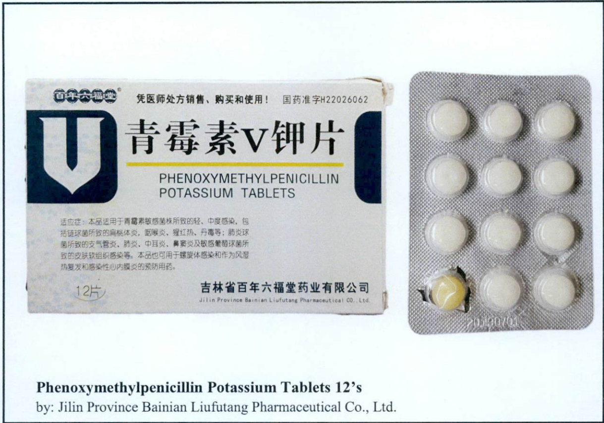
Phenoxymethylpenicillin Potassium Tablets 12's by: Jilin Province Bainian Liufutang Pharmaceutical Co., Ltd.