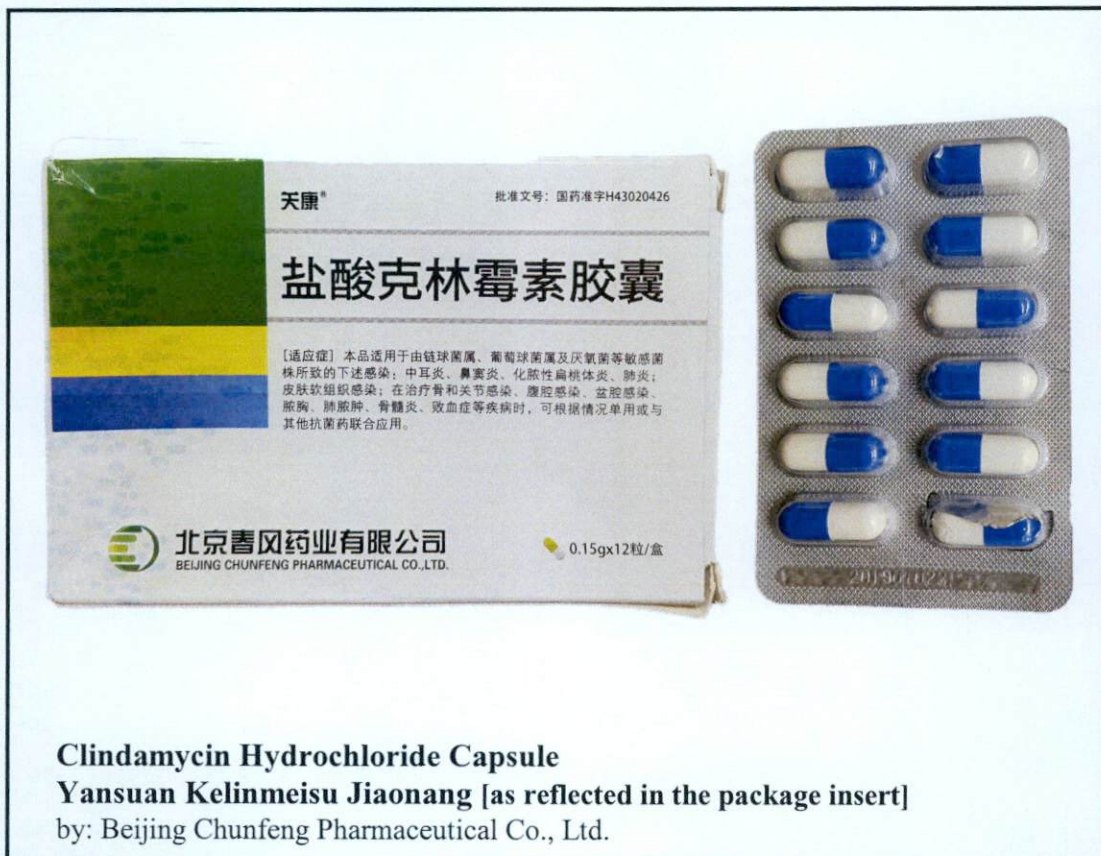
Clindamycin Hydrochloride Capsule Yansuan Kelinmeisu Jiaonang [as reflected in the package insert] by: Beijing Chunfeng Pharmaceutical Co., Ltd.

The Food and Drug Administration (FDA) advises the public against the purchase and use of the following unregistered drug products: