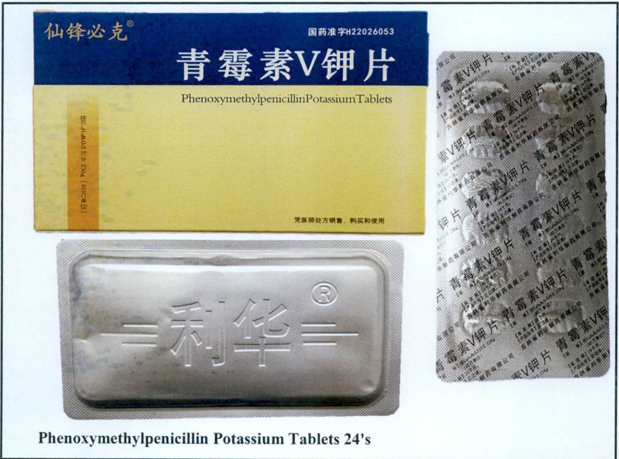
Phenoxymethylpenicillin Potassium Tablets 24's