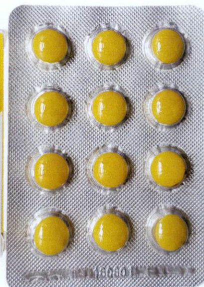
OTC Yanyan Pian [as reflected in the package insert] by: Chengdu Dikang Pharmaceutical Co., Ltd.