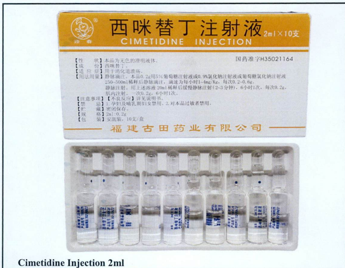
Cimetidine Injection 2ml

The Food and Drug Administration (FDA) advises the public against the purchase and use of the following unregistered drug products: