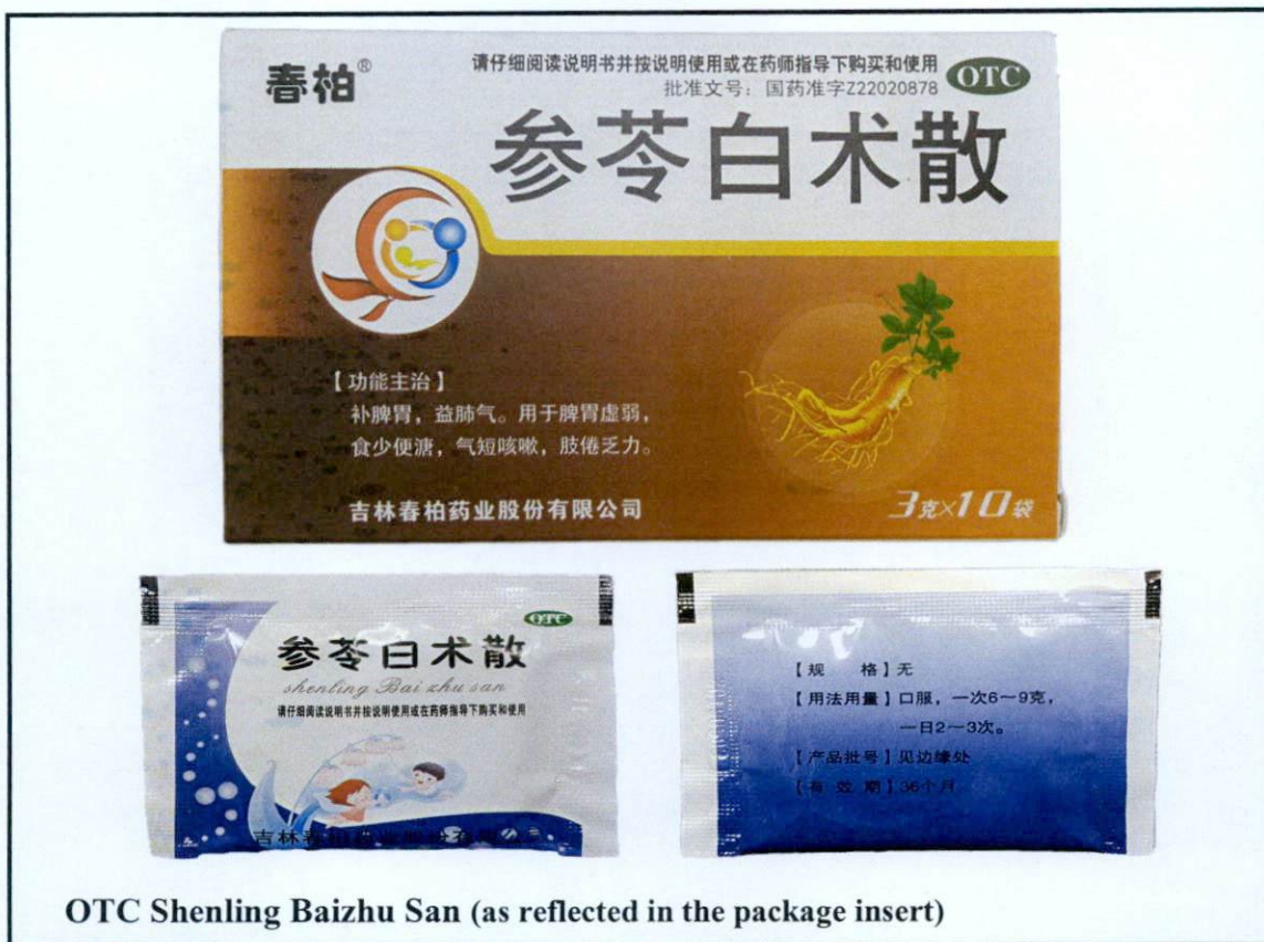
OTC Shenling Baizhu San (as reflected in the package insert)