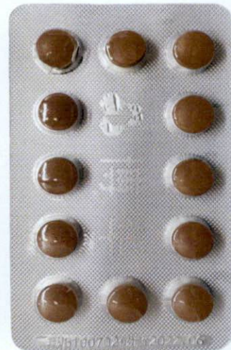
Ornidazole Tablets-Aoxiaozuo Pian 12's x 0.25g [as reflected in the package insert] by: Huadong Medicine (Xi'an) Bodyguard Pharmaceutical Co., Ltd.