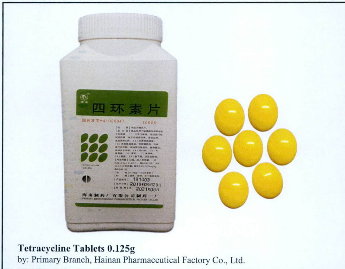
Tetracycline Tablets 0.125g

The Food and Drug Administration (FDA) advises the public against the purchase and use of the following unregistered drug products: