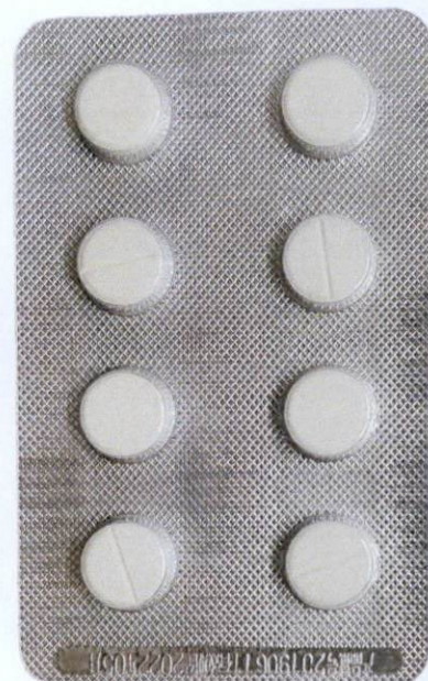
Yansuan Anxiusuo Fensanpian 30mg