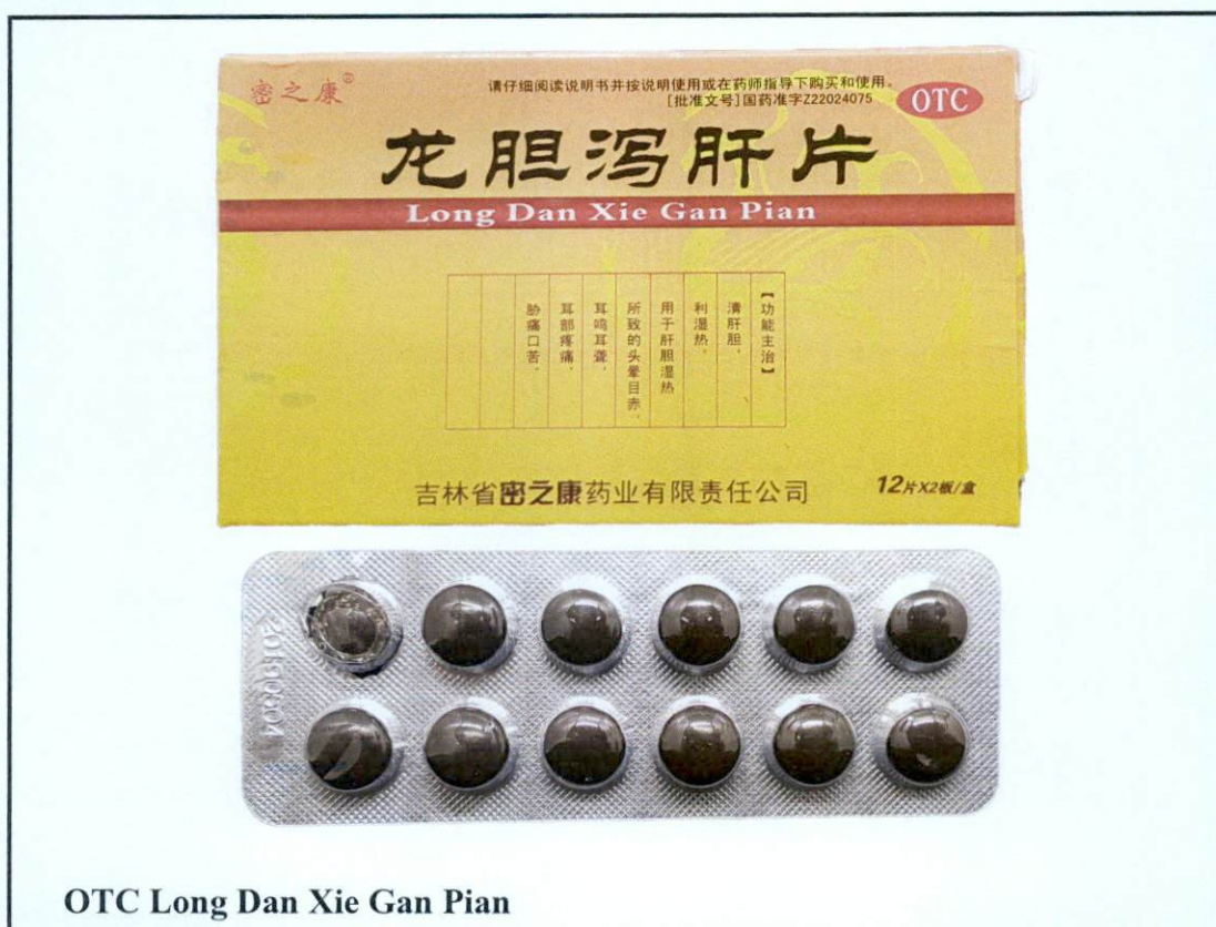
OTC Long Dan Xie Gan Pian

The Food and Drug Administration (FDA) advises the public against the purchase and use of the following unregistered drug products: