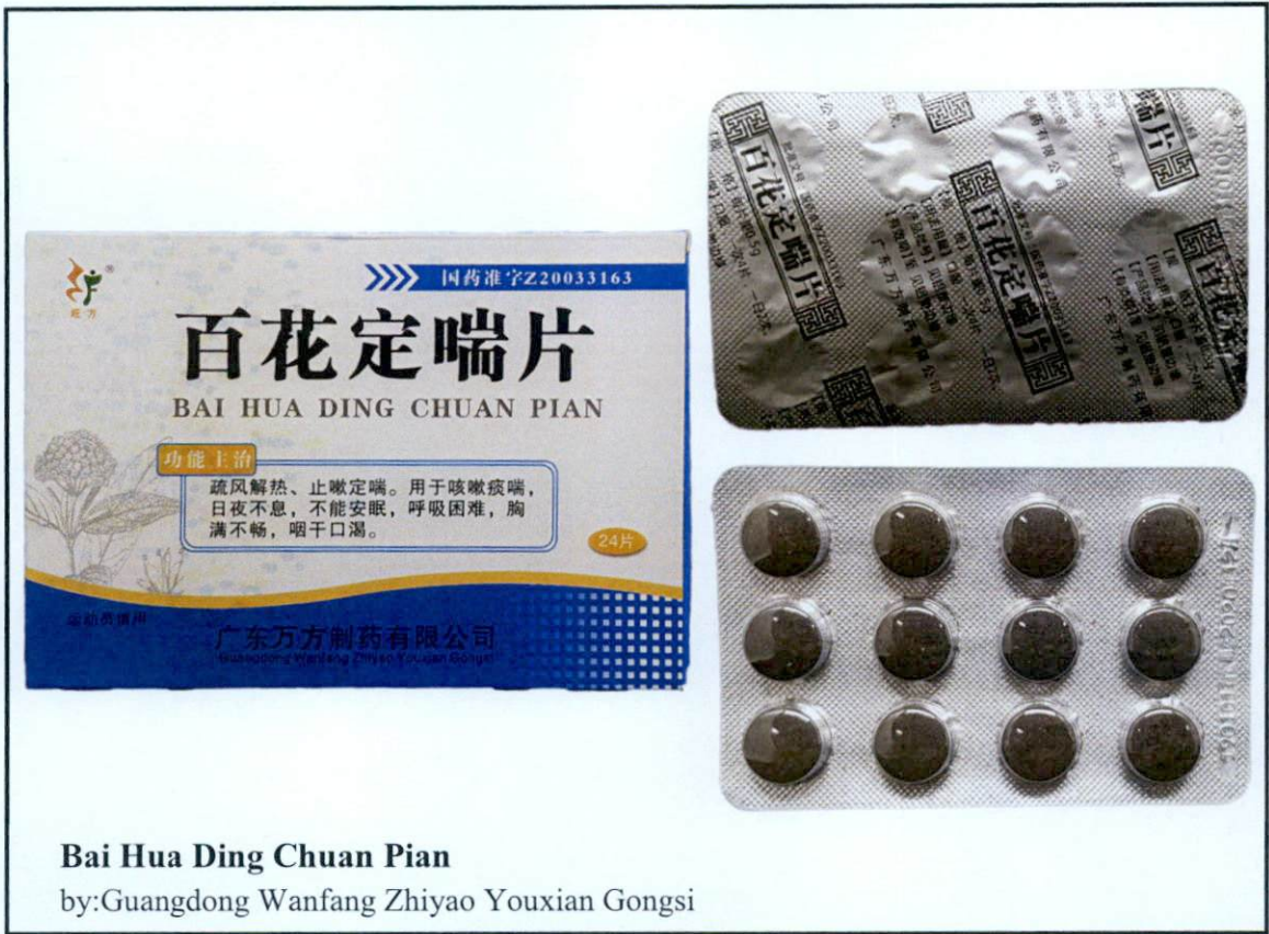
Bai Hua Ding Chuan Pian by:Guangdong Wanfang Zhiyao Youxian Gongs