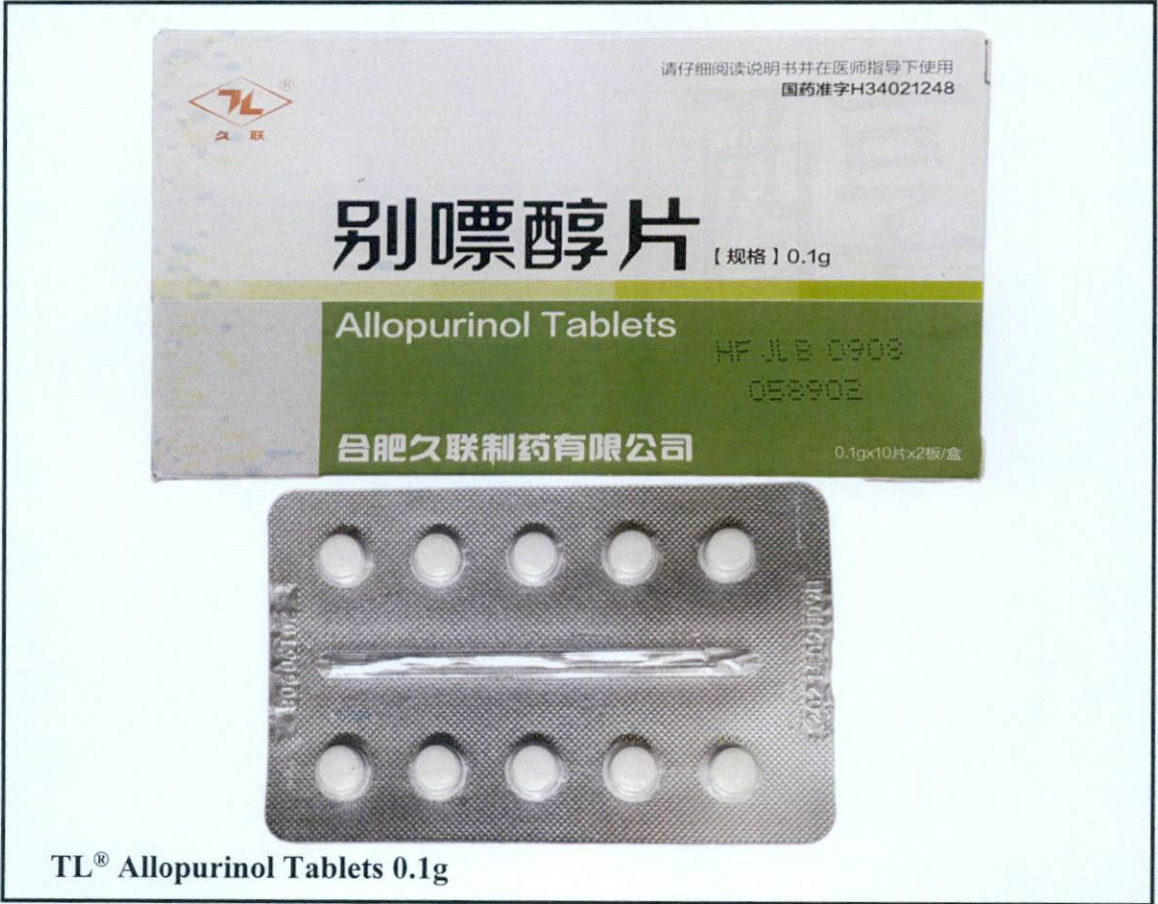
TL® Allopurinol Tablets 0.1g