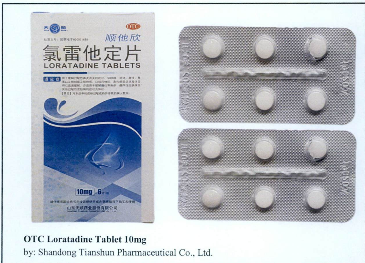
OTC Loratadine Tablet 10mg