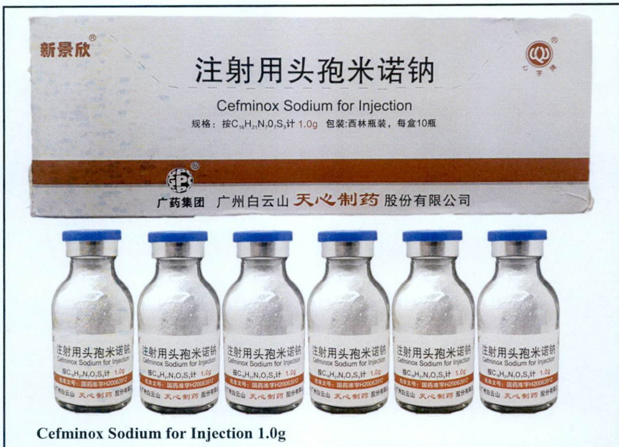
Cefminox Sodium for Injection 1.0g