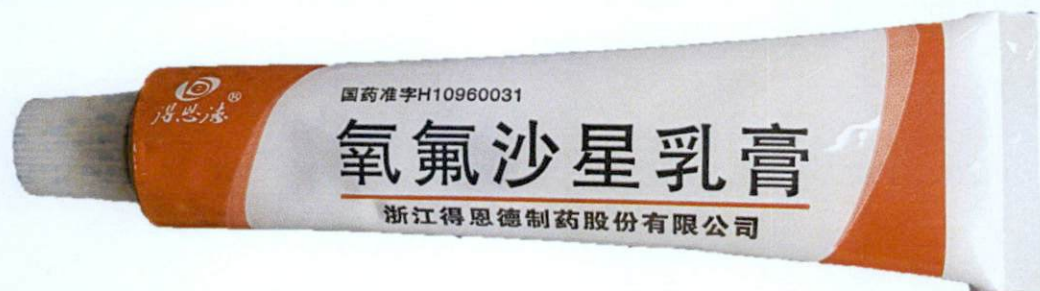
Ofloxacin Cream 10g