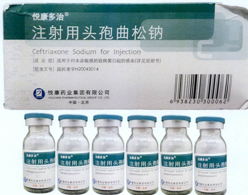
Youcare Ceftriaxone Sodium for Injection 1.0g

by: Youcare Pharmaceutical Group Co., Ltd.