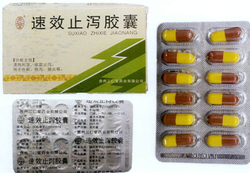
Suxiao Zhixie Jiaonang 0.3g

by: Guizhou Sareto Pharmaceutical Co., Ltd