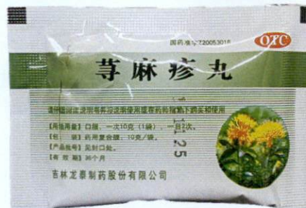
OTC Tian Ci Tang® Xunmazhen Wan 6's