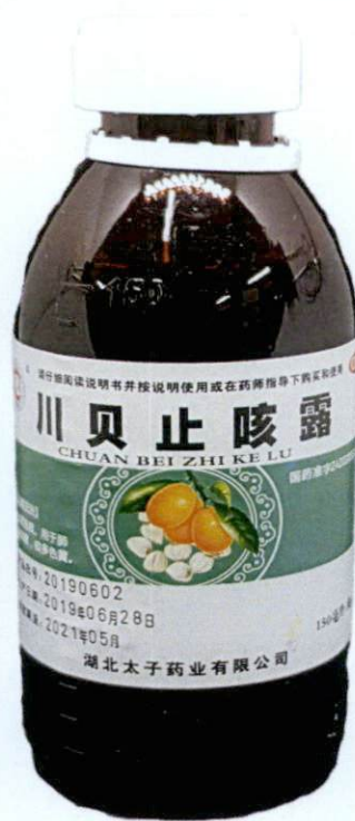
OTC Chuan Bei Zhi Ke Lu by: Hubei Taizi Pharmaceutical Co., Ltd.