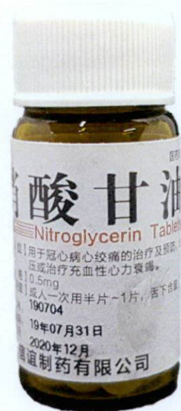
Sine® Nitroglycerin Tablets 36's by: Shandong Xinyi Pharmaceutical Co., Ltd.