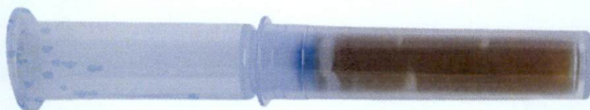
Bangerjie β-Vaginal Stuffing Agent 1 Syringe X 0.18mg/ml, 3g by: Jilin Medical Equipment Co., Ltd.