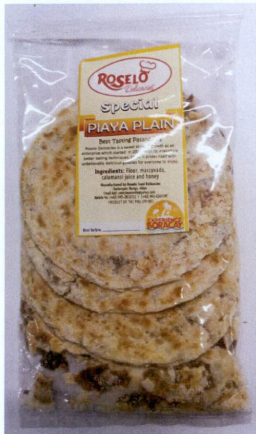
Figure 3. Unregistered ROSELO DELICACIES Special Piaya Plain