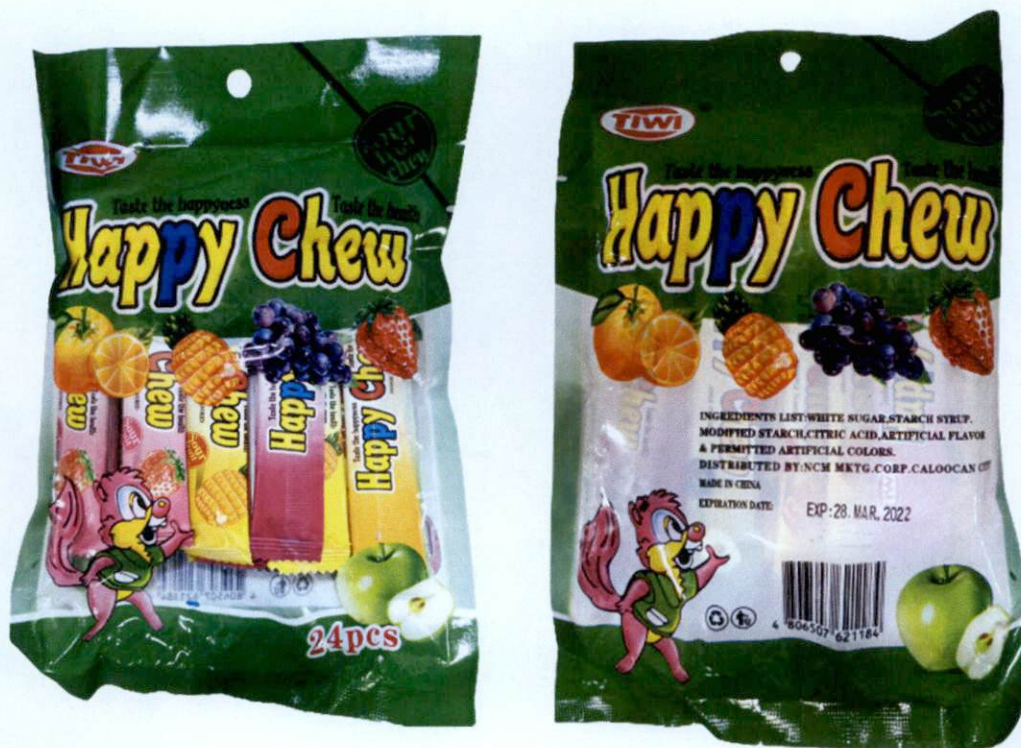
Figure 5. Unregistered TIWI HAPPY CHEW Sour Fruit Chew