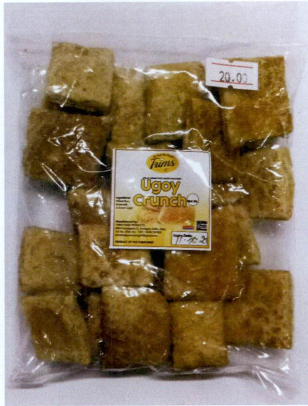
Figure 2. Unregistered TRIMS Ugoy Crunch