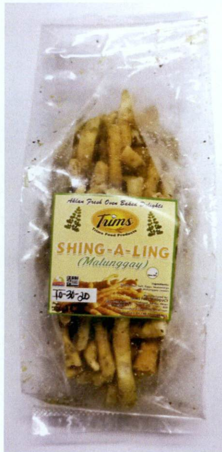
Figure 1. Unregistered TRIMS Shing-a-ling (Malunggay)

The Food and Drug Administration (FDA) warns all healthcare professionals and the general public NOT TO PURCHASE AND CONSUME the following unregistered food products: