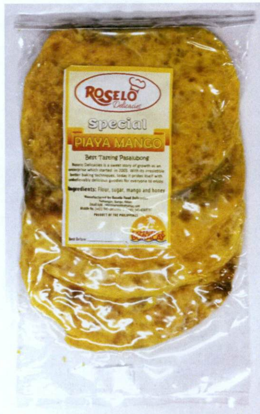
Figure 4. Unregistered ROSELO DELICACIES Special Piaya Mango