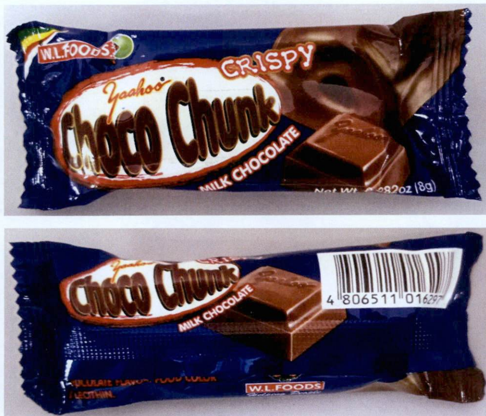
Figure 3. Unregistered W.L. FOODS YAAHOO Choco Chunk Milk Chocolate