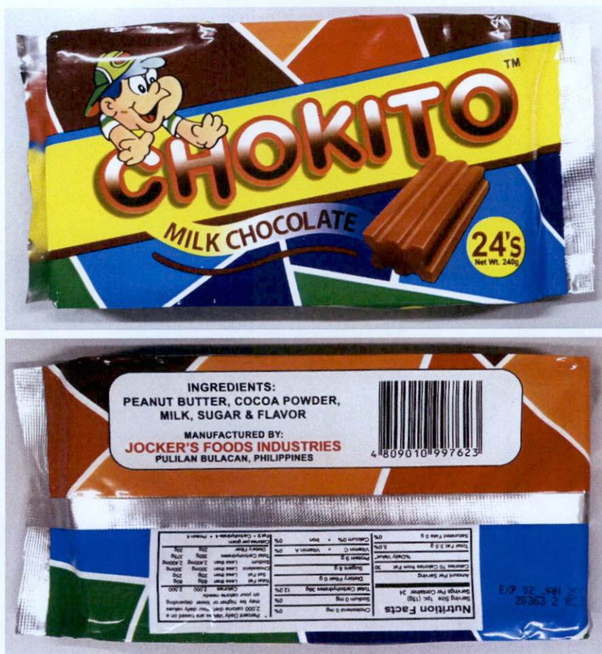
Figure 1. Unregistered CHOKITO Milk Chocolate

The Food and Drug Administration (FDA) warns all healthcare professionals and the general public NOT TO PURCHASE AND CONSUME the following unregistered food products: