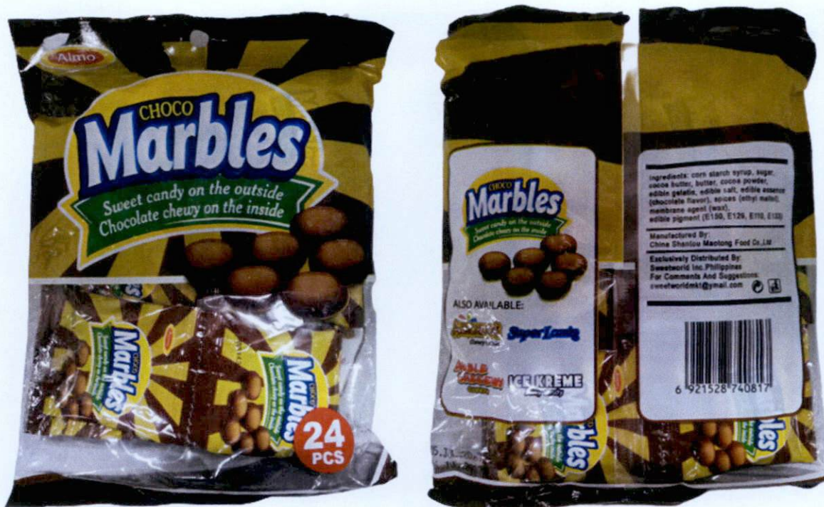
Figure 4. Unregistered ALMO Choco Marbles