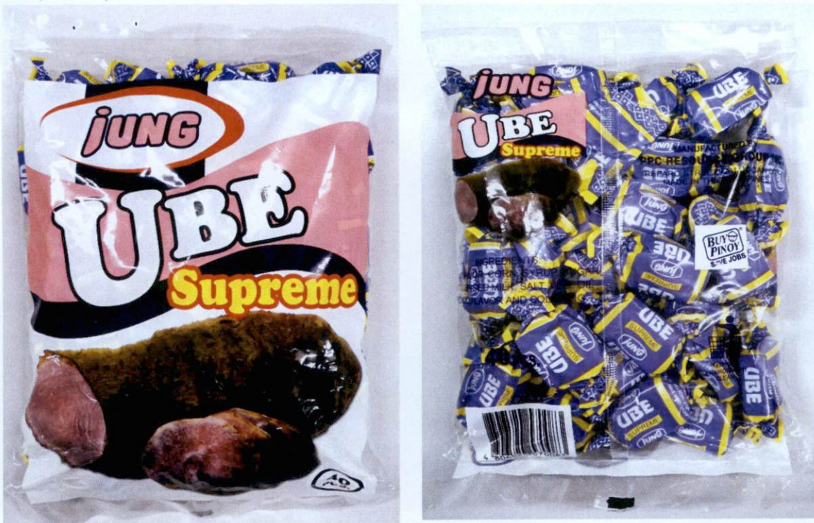
Figure 2. Unregistered JUNG Ube Supreme