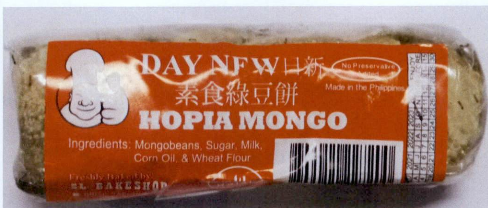
Figure 5. Unregistered DAY NEW Hopia Mongo

The FDA verified through post-marketing surveillance that the abovementioned food products are not registered and no corresponding Certificates of Product Registration (CPR) have been issued. Pursuant to the Republic Act No. 9711, otherwise known as the “Food and Drug