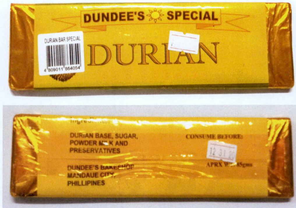
Figure 3. Unregistered DUNDEE'S SPECIAL Cebu Durian Bar