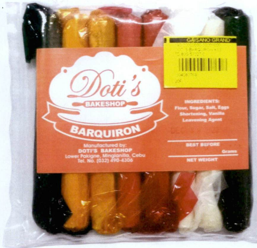
Figure 2. Unregistered DOTI'S BAKESHOP Barquiron