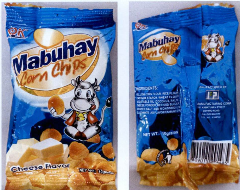
Figure 5. Unregistered MABUHAY CORN CHIPS Cheese Flavor