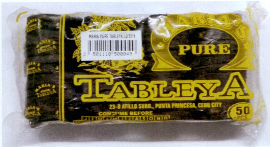
Figure 4. Unregistered MARIA'S Pure Tableya