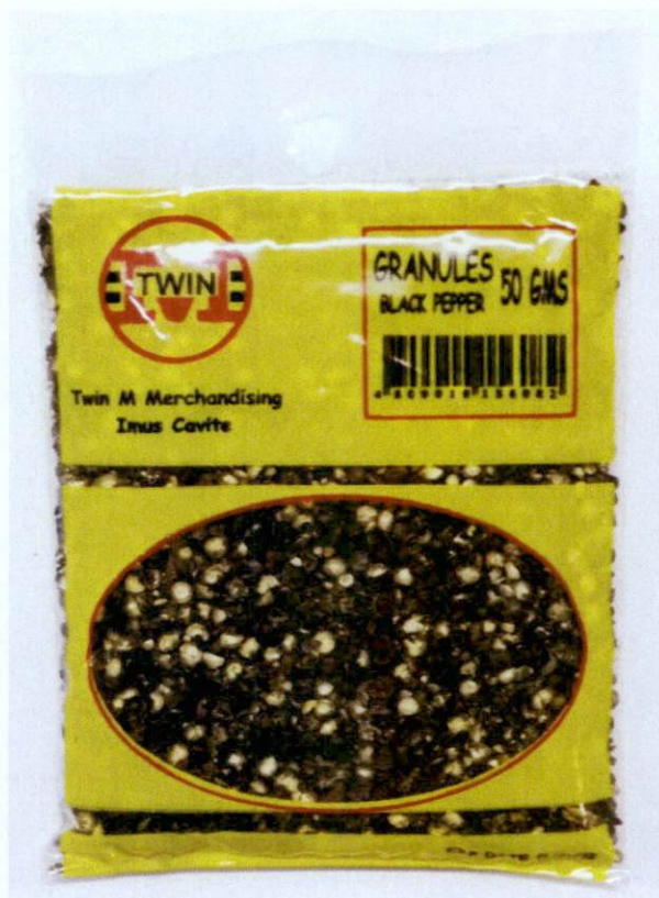
Figure 3. Unregistered TWIN M Black Pepper Granules