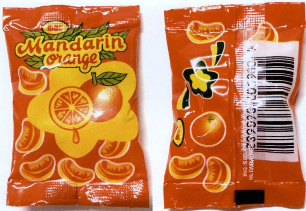
Figure 5. Unregistered MAC Mandarin Orange