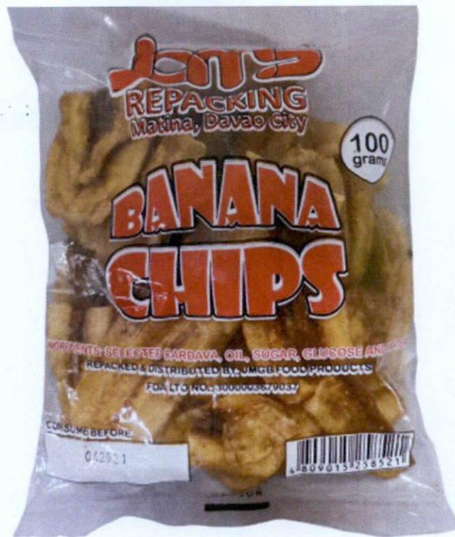
Figure 2. Unregistered JAMS REPACKING Banana Chips