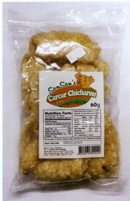
Figure 1. Unregistered SANSAN'S Carcar Chicharon Lite

The Food and Drug Administration (FDA) warns all healthcare professionals and the general public NOT TO PURCHASE AND CONSUME the following unregistered food products: