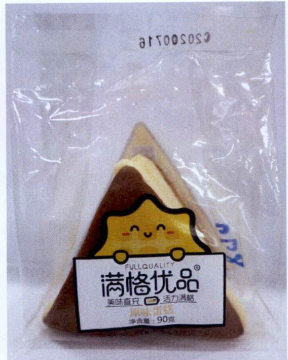
Figure 3. Unregistered Full Quality Triangular Bread in Clear Plastic Pouch (In Foreign Language)