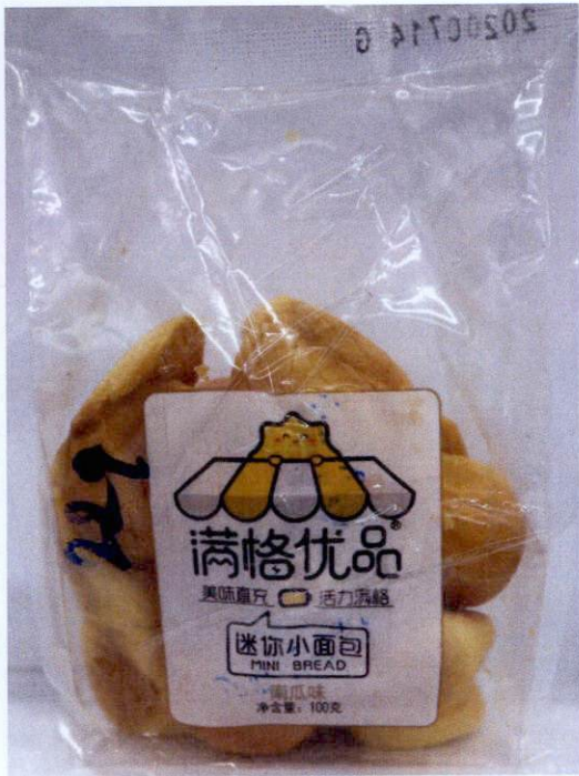
Figure 2. Unregistered Mini Bread in Clear Plastic Pouch with White Label (In Foreign Language)