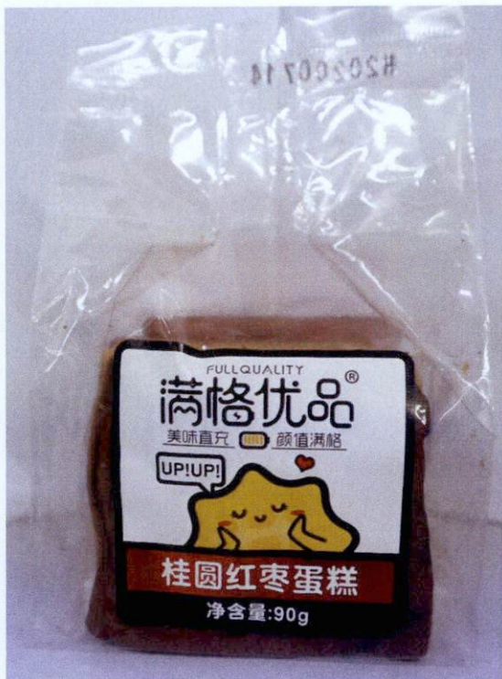
Figure 4. Unregistered Full Quality Bread Up-up (In Foreign Language)