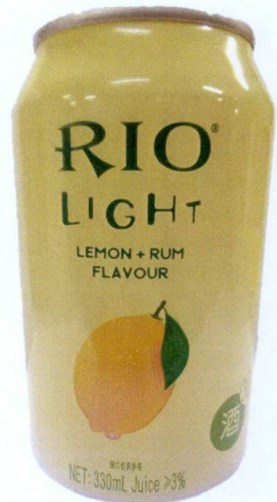
Figure 5. Unregistered RIO Light Lemon + Rum Flavor (In Foreign Language)