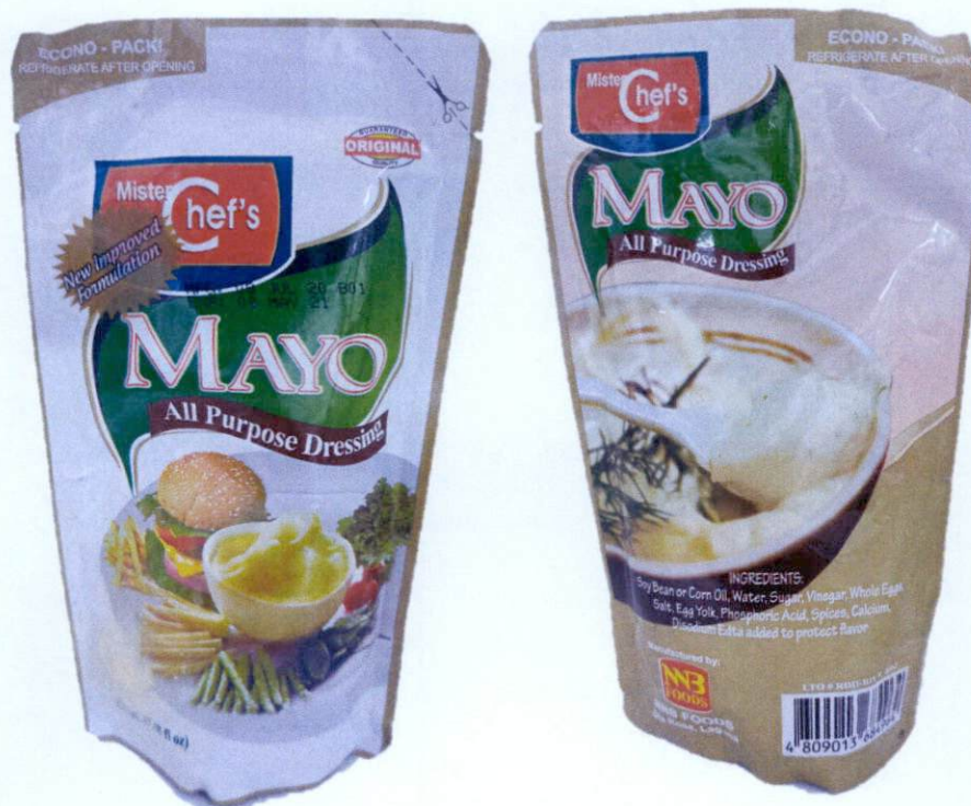
Figure 1. Unregistered MASTER CHEF'S Mayo All Purpose Dressing

The Food and Drug Administration (FDA) warns all healthcare professionals and the general public NOT TO PURCHASE AND CONSUME the following unregistered food products: