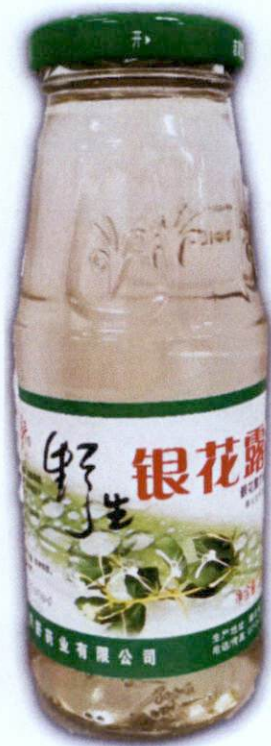
Figure 4. Unregistered Glass Bottle with Green Lid with Clear Liquid and Image of Leaves (In Foreign Language)