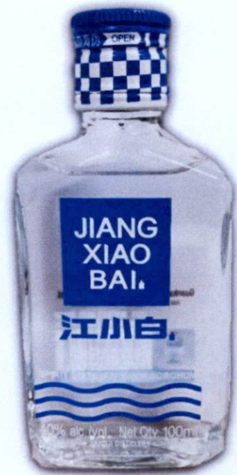
Figure 3. Unregistered JIANG XIAO BAI Spirit Distilled from Sorghum (In Foreign Language)