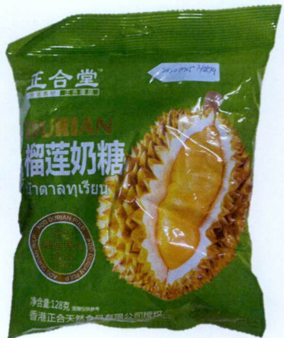
Figure 5. Unregistered DURIAN Food Product in Green Plastic Packaging with Image of Jack Fruit (In Foreign Language)