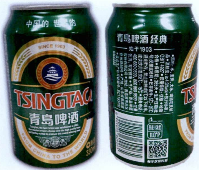
Figure 2. Unregistered TSINGTAO Beer in Green and Gold Colored Aluminium Can (In Foreign Language)