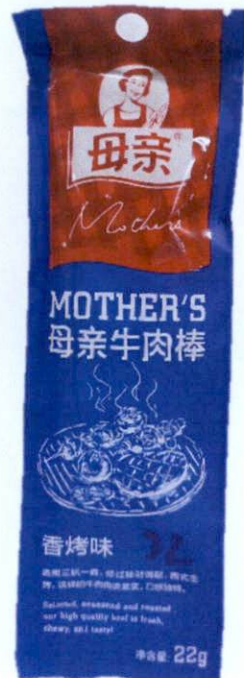
Figure 1. Unregistered MOTHER'S Beef in Blue Plastic Pack (In Foreign Language)

The Food and Drug Administration (FDA) warns all healthcare professionals and the general public NOT TO PURCHASE AND CONSUME the following unregistered food products: