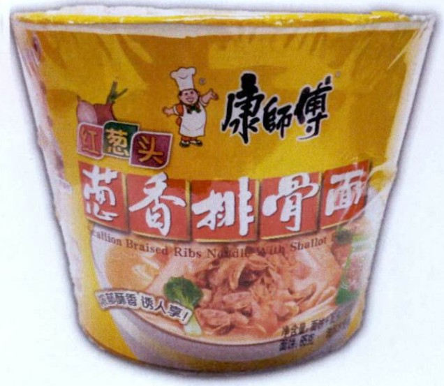
Figure 3. Unregistered Instant Cup Noodles in Yellow Packaging Scallion Braised Beef Shallot Flavor (In Foreign Language)