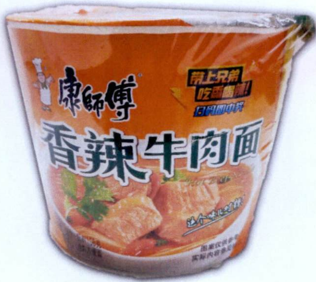
Figure 2. Unregistered Instant Cup Noodles in Orange Paper Cup Packaging with Image of Beef (In Foreign Language)