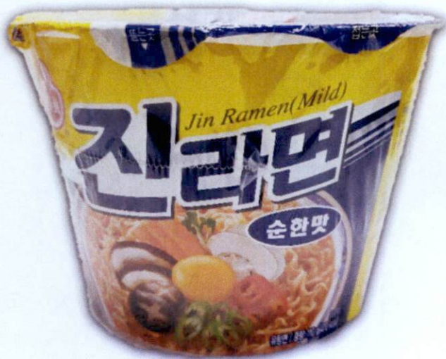
Figure 4. Unregistered JIN RAMEN Instant Cup Noodles Mild (In Foreign Language)