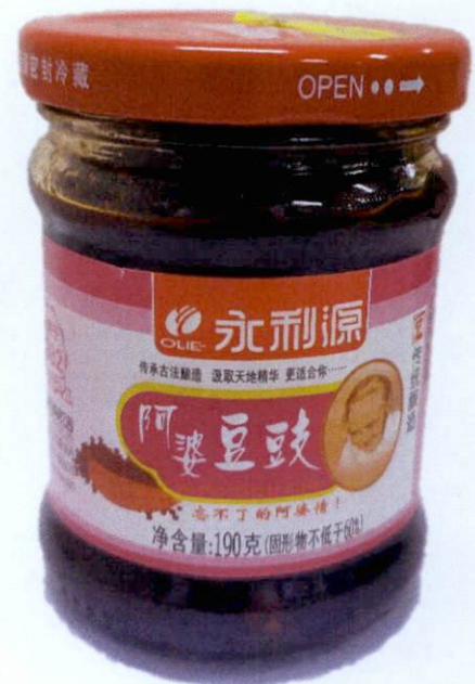
Figure 5. Unregistered Glass Jar with Red Lid with Image of An Old Woman (In Foreign Language)