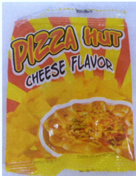
Figure 1. Unregistered PIZZA HUT Cheese Flavored Snack

The Food and Drug Administration (FDA) warns all healthcare professionals and the general public NOT TO PURCHASE AND CONSUME the following unregistered food products: